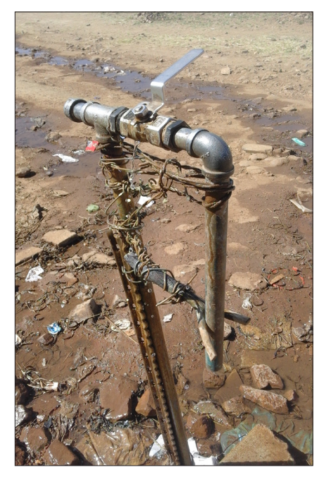
Figure 4: A leaking tap fixed with a forked stick and barbed wire

After the taps were installed, residents then shared in a meal, usually of pap, marog (a vegetable similar to spinach) and some meat, when possible. Skhokhorito once noted that some residents were annoyed by 'freeloaders' (people who did not participate in the construction of the infrastructure) who often joined in the meals, but that, due to shared poverty, he could not show them