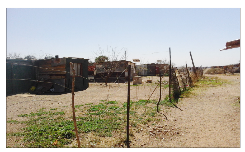
Figure 2: A DIY-formalised street with DIY-formalised stands in Marikana

To accommodate their right to water and to illustrate water's ability to delineate social power (Gandy, 2004), Marikana residents used an innovative DIY formalisation plan: they installed communal taps as a pragmatic local solution to service delivery for their settlement. Residents' DIY formalisation process,