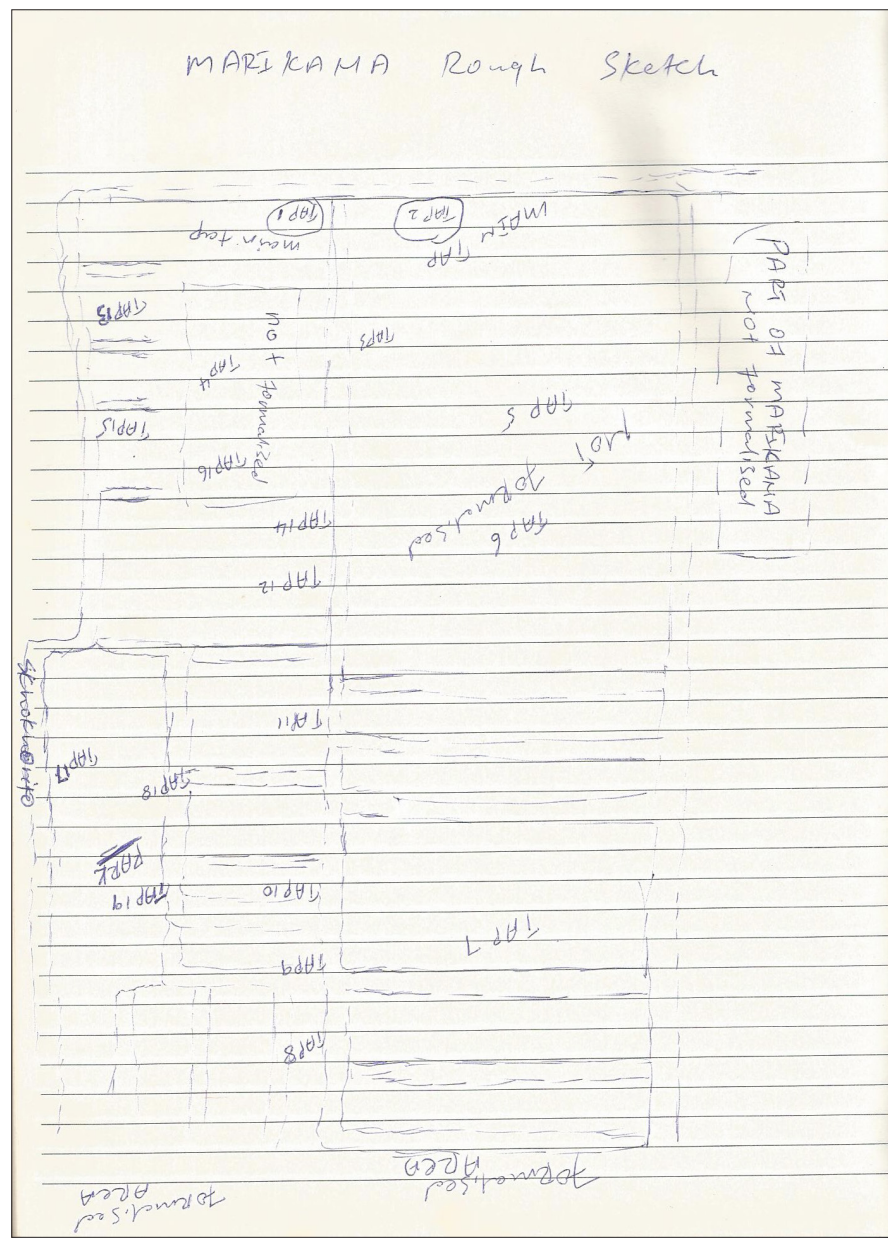
Figure 3: Hand-drawn map of Marikana, indicating formalised as well as non-formalised areas of the settlement and the location of the autoinstalled taps. Skhokhorito Mhala, the researcher's main informant, drew it in the researcher's field journal on 6 September 2016

Since the residents themselves installed the water infrastructures, they also took the responsibility, or perhaps to use Haraway's (2016: 68) notion "response-ability", for maintaining these infrastructures. Leakages caused by overuse of the taps, as over one hundred people depend on one communal tap, and the consequent breakage of the tap mechanisms were quickly fixed by residents in innovative ways, such as using forked sticks and wire (see Figure 4).