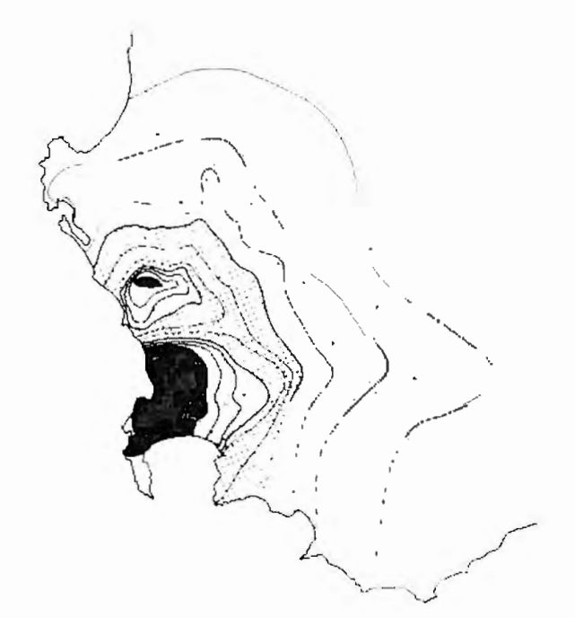
Figure 4 ISOPOTENTIAL MAP Size of Mamre increased to 500 000 people

All of this requires a high degree of planning, and there is no indication that this planning is occurring.