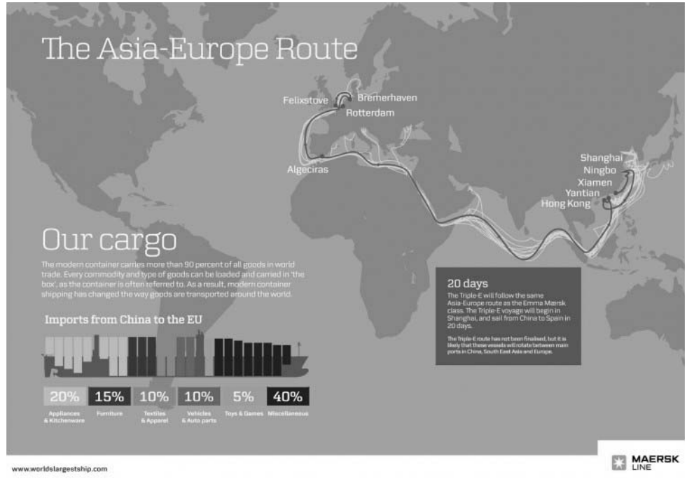
Figure 2: The Asia-Europe Route

Asia-Europe shipping can go in one of two directions, depending on the capacity of the world's two most important canals, Panama and Suez. Both routes have problems. For the growing economies of South Asia, the Suez route is most likely. The Suez has less ship-size limitations because it has no locks, but might have limitations vis-à-vis the new ship sizes. Furthermore, once ships get to the Mediterranean Sea, they may face a 10 to 20 day trip around Europe to the west and north coast to get to ports that can handle the larger ship size and cargo volume. The port at Constanța would be well positioned for the South Asia-to-Europe shipping if it were able to handle the large ships and develop better inland handoff capacity.