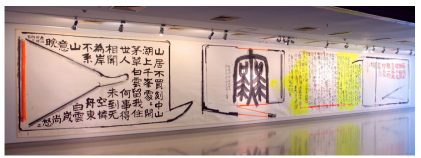
Fig. 4a. Wang Dongling and Martin Wehmer, Visual Dialogue (left half), 2010. Painting and calligraphy, acrylic colors and Chinese ink on Xuan paper. Total dimension of work: 220 x 32000 cm.