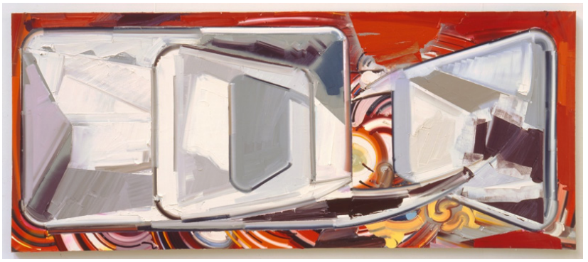
Fig. 6b. Martin Wehmer, BLA, Series Ofigur, 2006. Oil on canvas, 140 x 350 cm.