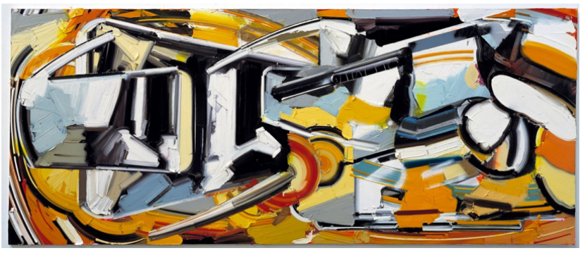
Fig. 6c. Martin Wehmer, Wumme, Series Ofigur, 2007. Oil on canvas, 170 x 410 cm. Image courtesy of Martin Wehmer.