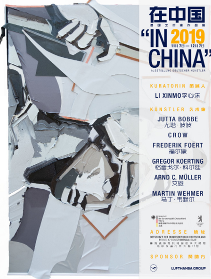
Fig. 3b. Official poster of the group exhibition "In China": Ausstellung deutscher Künstler/Zai Zhongguo: Deguo yishujia zuopin zhan, held at the German Embassy Beijing, November 7–December 7, 2019.<sup>9</sup>

This paper builds upon critical contemporary discourses on Chinese art and art history, and draws from transcultural and postcolonial theory, semiotics, picture theory, comics studies, and translation studies. It is divided into five sections. The first section provides an introduction to Chinese modern and contemporary calligraphy through the critical art historical and geographical discourses prevalent in the PRC since the late 1970s. Section two presents an