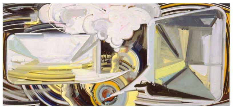
Fig. 6a. Martin Wehmer, LOKOBla, Series Ofigur, 2005. Oil on canvas, 190 x 420 cm.