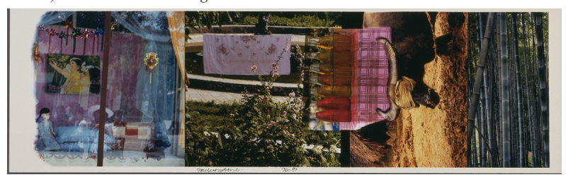
Fig. 5. Robert Rauschenberg, Studies for Chinese Summerhall #V, 1984.Chromogenic print. 30 x 99 3/4 inches (76.2 x 253.4 cm). University of South Florida, Tampa.<sup>28</sup>