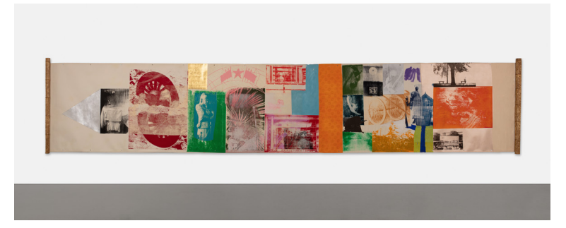
Fig. 7. Robert Rauschenberg, Untitled / ROCI CHINA, 1985. Silkscreen ink, acrylic, fabric, gold and silver leaf, and graphite on fabric-laminated paper with rattan. 68 1/8 x 366 1/8 x 4 3/8 inches (173 x 930 x 11.2 cm). ©Robert Rauschenberg Foundation.<sup>32</sup>

Exhibited at ROCI China alongside mixed-media works by Rauschenberg (see figs. 7, 8, and 9) were films about the artist, the ROCI, and American culture. Taking place in conjunction with the exhibition were performances by the Trisha Brown Dance Company, Glacial Decoy (1979) and Set and Reset (1983), staged at the Minzhu Wenhua Gong Theatre, Beijing, on 17 and 19 November. In preparation for ROCI China , the walls of the designated exhibition spaces at the National Art Museum were painted white and temporary divisions added, in accordance with the stripped-down "white cube" format of museum and gallery display that was well-established within Western/ized artworld contexts at the time.<sup>31</sup>