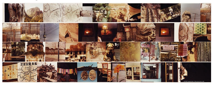
Fig. 6. Robert Rauschenberg, Chinese Summerhall, 1982, Chromogenic print and fabric collage backing to be used if it is installed in a free-hanging situation. 30 \times 1200 inches (76.2 x 3048 cm).<sup>29</sup>