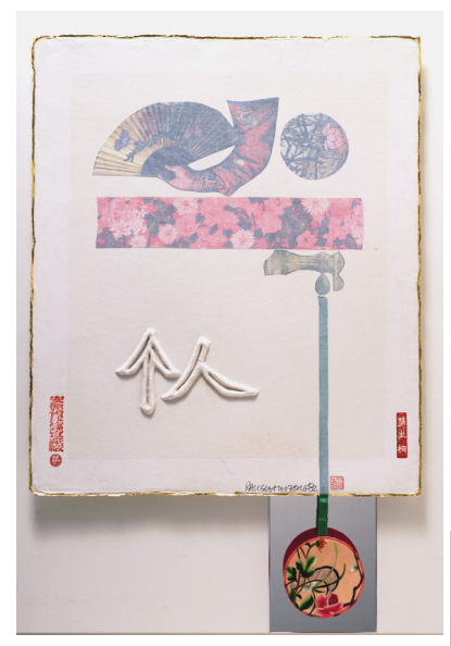
Fig. 1. Robert Rauschenberg, Individual (from 7 Characters), 1982. Silk, ribbon, paper, paper-pulp relief, ink, and gold leaf on handmade Xuan paper, with mirror, framed in a Plexiglas box. 43 x 31 x 2 1/2 inches (109.2 x 78.7 x 6.4 cm). ©Robert Rauschenberg Foundation.<sup>23</sup>

paper and attached a cloth medallion to each collage (see figs. 1 and 2). The exhibition, Rauschenberg in China , staged at the Museum of Modern Art, New York, between 2 December 1982 and 1 February 1983, featured works from the 7 Characters series. Works from the series were also included in ROCI China and other ROCI exhibitions.