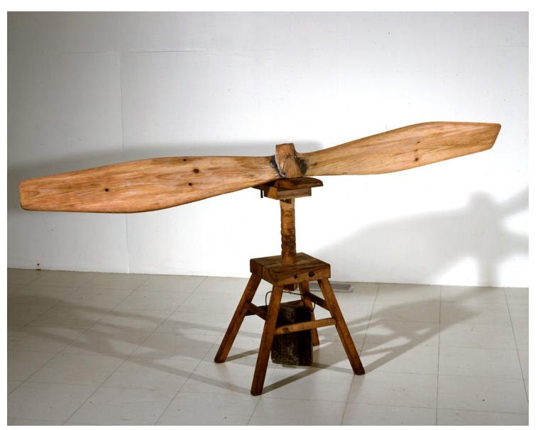
Fig. 9. Robert Rauschenberg, Prehistoric Rose Spore (Kabal American Zephyr), 1981. Mixed media construction. 34 1/2 x 76 1/2 x 15 1/4 inches (87.6 x 194.3 x 38.7 cm). ©Robert Rauschenberg Foundation.<sup>34</sup>