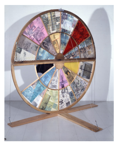
Fig. 8. Robert Rauschenberg, 28 Famous Murders with Poems (Kabal American Zephyr), 1981. Solvent transfer, acrylic, and Plexiglas on wood construction. 93 x 94 x 94 inches (236.2 x 238.8 x 238.8 cm). Robert Rauschenberg Foundation. <sup>33</sup>