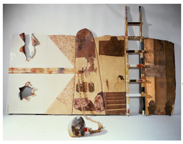
Fig. 3. Robert Rauschenberg, Dirt Shrine: South (Japanese Clayworks), 1982. Transfer on highfired ceramic. 120 x 179 1/2 x 75 inches (304.8 x 455.9 x 190.5 cm). ©Robert Rauschenberg Foundation.<sup>26</sup>

Rauschenberg subsequently visited Japan on two occasions in 1982, between 15 July–31 August and 22 September–8 October, to initiate the production of two series of works in collaboration with the Otsuka Ohmi Ceramics Company, Shigaraki: Japanese Clayworks (1982/1985) and Japanese Recreational Clayworks (1982–1983/1985/1989) (see figs. 3 and 4). Individual works from these series were exhibited at ROCI China . Back in the USA during the autumn of 1982, Rauschenberg produced a 75 cm high x 30.5 m long mural of photographs he took while travelling in the PRC. The composite image, Chinese Summerhall (1982), as well as a number of accompanying studies (see figs. 5 and 6) were included in an International Festival of Photography staged at Arles, France, between 3 July–6 August 1983, as well as in ROCI China .