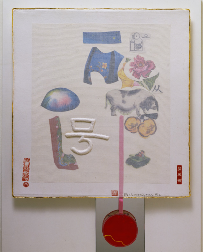
Fig. 2. Robert Rauschenberg , Individual (from 7 Characters), 1982. Silk, ribbon, paper, paper-pulp relief, ink, and gold leaf on handmade Xuan paper, with mirror, framed in a Plexiglas box. 43 x 31 x 2 1/2 inches (109.2 x 78.7 x 6.4 cm). © Robert Rauschenberg Foundation. <sup>24</sup>