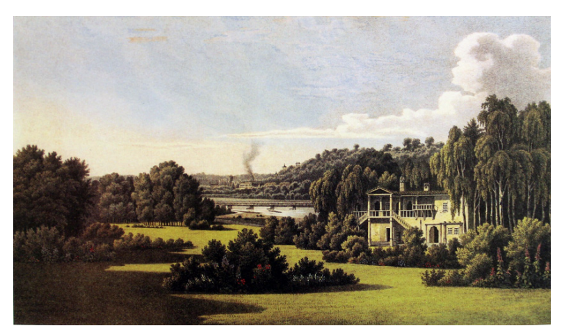
Fig. 4: Wilhelm Schirmer (watercolor) and J. Renz (lithograph), Tafel XXI. Fasaneriegebäude nach dem Modell eines türkischen Landhauses, Bad und Alaunberge, hand-colored lithograph plate in book, 33.8 × 49.4 cm, in Pückler-Muskau, Andeutungen über Landschaftsgärtnerei.

Towards the end of the quoted essay, the anonymous author defines the ideal state of art as one that represents "beautiful, simple nature [...]."48 This ideal complements Pückler's own understanding of the relation of art and nature in the Andeutungen. The beautification of the landscape—"nature idealized through art"-is, to Pückler, a totalizing process that includes "the palaces and gardens of the great [and] the humble dwellings of the poor tenant" within a "harmonious whole." This also becomes evident in the illustrations of the Andeutungen. For instance, plate XXI depicts the smoke of an alum factory in the distance (Fig. 4). Industrial sites, such as the alum factories adjacent to Muskau Park, are not excluded from Pückler's holistic, all-encompassing concept. They become an integral part of the visual and material order, which Pückler even presents as an attraction for visitors to the park. In the text, he praises the spectacle of a small natural volcano, a lignite "mine fire [with] continuous smoke and occasionally sparkling small flames."50 In addition, Pückler proposes plans for so-called "worker colonies" as habitations for the miners and the workers of the park (Fig. 5). His ordering vision thus permeates the lives of his (former) subjects who, at the time, were being transformed into Prussian citizens