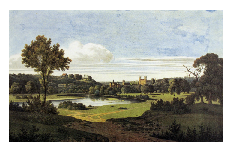
Fig. 1: Wilhelm Schirmer (watercolor) and O. Hermann (lithograph), Tafel XXXVII. Blick vom Belvedere des Lucknitzer Hügels auf die Stadt und das Schloss, hand-colored lithographic plate in book, 33.8 × 49.4 cm, in Von Pückler-Muskau, Andeutungen über Landschaftsgärtnerei.

Therefore, by the time Pückler made his contribution to the picturesque, the concept had already become a reproducible, commodified visual order. It is thus not surprising that many of the ideal landscapes in the Andeutungen look like variations of picturesque landscape paintings. As the Andeutungen volume was intended to be a handbook for wealthy landowners, its readership was most likely familiar with the visual conventions of picturesque landscape painting.<sup>35</sup> As a set of conventions, variations of the picturesque were thus not only already well established, but, in their normative patterns, permitted a flexible reproduction and adaptation to other contexts and localities—an ideal prerequisite for the economic success of the Andeutungen .<sup>36</sup> The mobilization of the picturesque in the Andeutungen also reinforces the position of a seeing, singular subject to whom the landscape is made visually available. Pückler emphasizes the importance of frames and boundaries for the "proper" experience of landscape. But, he argues, even these must appear natural and barely