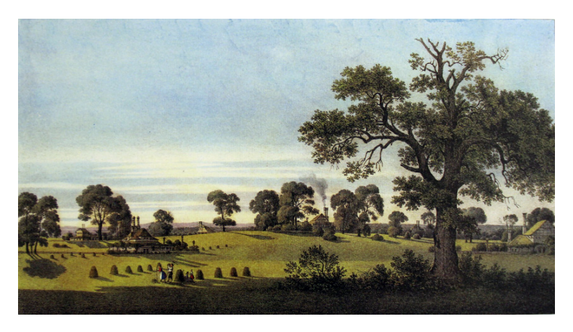
Fig. 5: Wilhelm Schirmer (watercolor) and H. Mützel (lithograph). Tafel XXXIX. Cottages der Colonie Gobelin, hand-colored lithograph plate in book, 33.8 \times 49.4 cm, in Pückler-Muskau, Andeutungen über Landschaftsgärtnerei.

In this definition, nature is a resource available for the betterment of the individual human and the entire society. It is possible to transform and reproduce this nature, a process that Pückler describes as "nature-painting (if I can call the evocation of an image like this, not through colors, but with real forests, mountains, meadows and rivers, and introduce it to the area of art)."<sup>52</sup> This claim to painting is in part strategic, as it allows Pückler to position himself as an artist whose role is to transform untouched nature into an art form. To the author, art is of central utility for the governance of a society.<sup>53</sup>