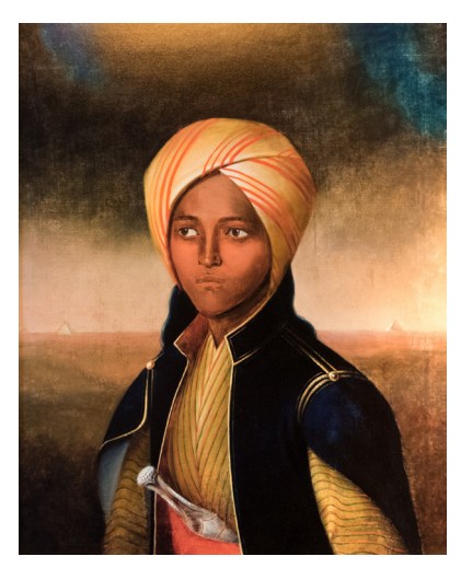
Fig. 11: Unknown Artist, Portrait of Machbuba, oil on canvas, ca. 1840, 72.5 × 59 cm, Branitz: Stiftung Fürst-Pückler-Museum Park und Schloss Branitz, inventory no. VII K1/353.