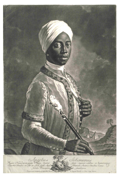
Fig. 12: Gottfried Haid, based on an artwork by Johann Nepomuk Steiner, Angelus Solimanus, ca. 1760 × 1765, engraving, Vienna: Wien Museum.