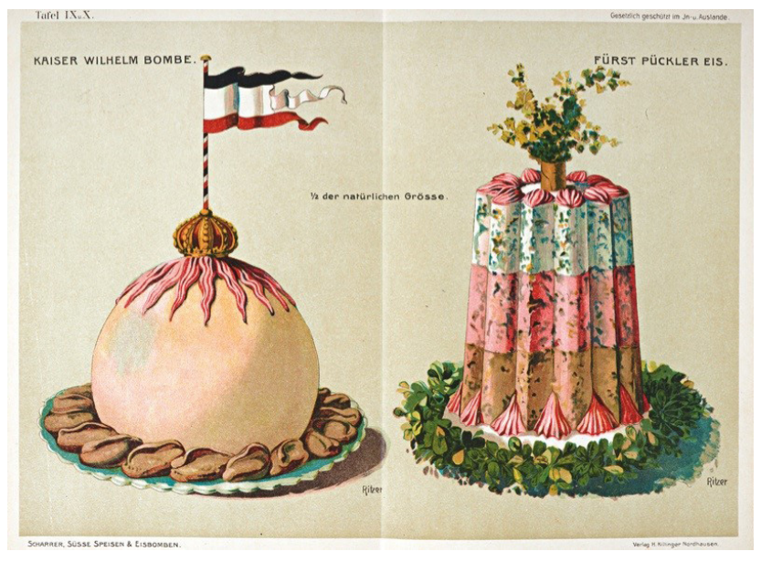
Fig. 8: Tafel IX, Kaiser Wilhelm Bombe and Tafel X, Fürst-Pückler-Eis, lithograph plates, in Carl Krackhart, Neues illustriertes Conditoreibuch, 1903.

of the Prussian imperial flag on the "Kaiser Wilhelm Bombe." Here, Pückler is represented as an integral part of the militaristic imperial order, an order that penetrates both the public and domestic lives. At the same time, Pückler is turned into a consumable product. In this illustration, pleasure, consumption, empire, and national identity collapse into each other. The materiality of the ice-cream, its ingredients, and the possibility of its availability to "every housewife" are decontextualized and naturalized in the schematic blank spaces that frame the dessert.