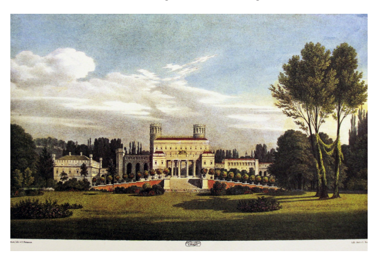
Fig. 3: Wilhelm Schirmer (watercolor) and O. Hermann (lithograph), Plate XV. Schloss und Rampe vom Bowling Green gesehen, hand-colored lithograph plate in book, 33.8 × 49.4 cm, in Pückler-Muskau, Andeutungen über Landschaftsgärtnerei.