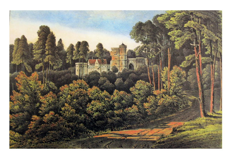
Fig. 2: Wilhelm Schirmer (watercolor) and J. Tempeltei (lithograph), Tafel XXIX. Die projektierte Burg nach dem Entwurf Schinkels, hand-colored lithographic plate in book, 33.8 \times 49.4 cm, in Pückler-Muskau, Andeutungen über Landschaftsgärtnerei.