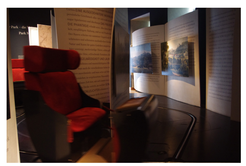
Fig. 10: Pückler? Pückler! Einfach nicht zu fassen. Installation view, Muskau Castle.