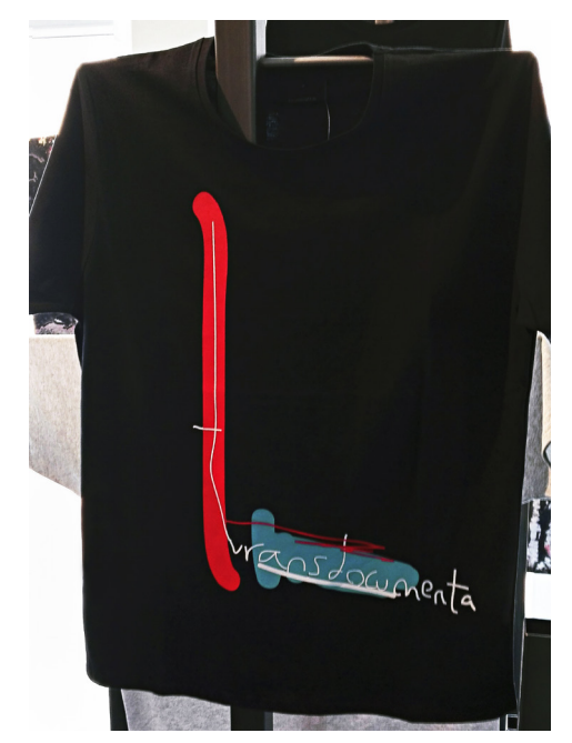
Fig. 1: T-Shirt with the slogan "transdocumenta," souvenir shop of documenta 14, Kassel, 2017.

However, Szymczyk neither discusses the meaning of this initial cultural urgency of documenta in his curatorial concept nor does he describe its potential effects on the cultural ethics of documenta 14 . Meanwhile, the practical implementation of this theoretical concept can be examined from a visitor's perspective. For example, documenta 14 was advertised with the slogan "transdocumenta," which was printed on a T-shirt and sold as a souvenir together with documenta 14 's publications in the accompanying gift shops (Fig. 1). What is actually meant by this self-image of documenta , that connects to the Latin prefix "trans-" in its meaning of "across," "beyond," or "through," and how does it relate to the cultural understanding of documenta 14 with its specific twofold structure of Kassel and Athens?