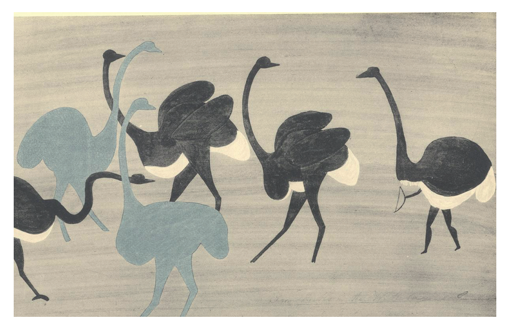
Illustration 3. Ostrich hunt.

Apart from the fact that this 'explanation' by a Bushman, supports Stow's belief in hunting disguises, it also implies that in Bleek's lifetime, he had inspected and studied an unidentified ostrich copy.