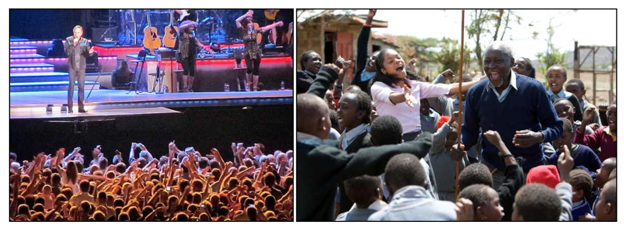
Figures 4 and 5: Diamond's affectionate interaction with the audience and Jane (Naomie Harris) celebrating with the learners and Maruge (Oliver Litondo) – a rather aged learner - in The First Grader – a BBC film.

The affection and interaction between Diamond and his audience is evident from Figure 4. In figure 5 a scene from the movie The First Grader represents the comparative feelings and interaction typical of some educational situations.