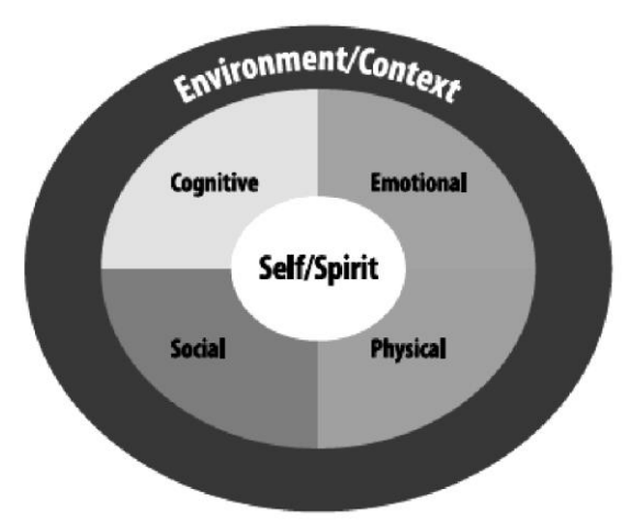
Figure 1: Human Development Model (Source: Ontario Ministry of Education, 2013, p. 4)

The marginalization of Indigenous peoples, and of their respective epistemologies, is perhaps most apparent in the model of human development found in the preface to the 2013 document (see Figure 1). This model is a variation of a First Nations medicine wheel, modified to include different concentric circles—an inner circle of "self/spirit" and an outer circle of "context" (OME, 2013, p. 4). In separating "self" from "context" in this manner, the model continues to perpetuate the long history of imposing colonial concepts, such as individuality, onto our understandings of Indigenous communities (Smith, 1999, pp. 47-50). These additions impose a Eurocentric way of thinking onto the medicine wheel, in which the different elements relate not through a relational totality but through an analytic hierarchy that subdivides the constituent elements.