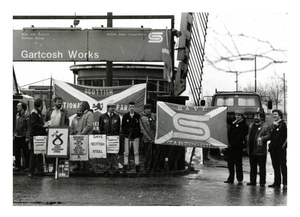
Campaign to save Gartosh Steel Works which eventually closed in 1989 'How many Scottish jobs must be lost before you vote for self-government?'

The first complete collection that came to SPA was that of <u>George Robertson</u>, MP for Hamilton (1978 – 1999) and Secretary General of NATO (1999 – 2004). Owing to his long career in politics, much of his professional papers cover the pre-devolution period and illuminate the road to Scotland re-establishing its own Parliament.