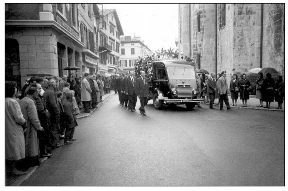
Aguirre's funeral in Saint-Jean-de-Luz, March 1960