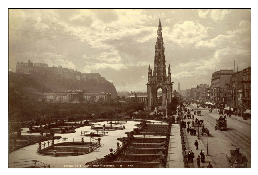
The Walter Scott memorial in Edinburgh, 1844 | PHOTOGRAPH BY GEORGE WASHINGTON WILSON 1860s

century monument to a cultural saint: a larger-than-life bronze full-length statue standing (sometimes sitting) up on a pedestal, positioned in the middle of a square. The location of the monument can, in the course of time, take the name of its 'patron' – which in this particular case happened in 1934 when the square was officially renamed to Schillerplatz. However, there are monuments that do not follow this standard setup. In terms of dominating the urban landscape, the colossal Walter Scott monument in Edinburgh (erected 1840-1844) is truly exceptional and may even be considered the most megalomaniac memorial to a writer in Europe. The double life-size statue of Scott seems somewhat lost beneath the sixtymetre neo-Gothic construction, containing sixty-four niches with statues of Scott's fictional and historical characters. According to Ann Rigney, this monument 'is not only remarkable for its size, but also as a relatively early example of the nineteenth-century celebration of artistic heroes, which would end up by dotting the capitals of Europe with statues to national writers and artists'.45