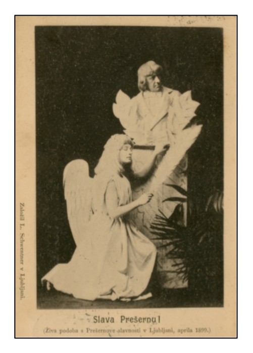
'Glory to Prešeren!', a postcard showing a tableau vivant (Ljubljana, 1899)

many elements of the nineteenth-century there Indeed. are commemorative culture that are redolent both of liturgy and, more specifically, of the veneration of Christian saints. Processions with flags or torches, the abundant use of choral singing, sermon-like orations and especially the emphasised iconolatry are some of the elements connecting both liturgy and the veneration of saints. There is always an icon of a cultural saint at the heart of a ritual - a monument, a bust, a portrait - and the honouring of such an icon is the utmost sacred moment often followed by outbursts of enthusiasm that sometimes evades control. This similarity in the orchestration of the ritual is what binds the cult of cultural saints and the cult of religious saints, rendering them their impressive power. However, it should be noted that ritual patterns did not only mark largescale events such as monument unveilings. Even minor events in distant villages, such as the unveilings of marble plaques in local contexts, school commemorations and intimate banquets, had their own ritual dynamics redolent of liturgy.