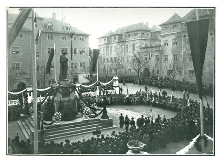
Centenary celebration of Schiller's death in Stuttgart, by the 1839 monument (1905) | WWW.GOETHEZEITPORTAL.DE

Habsburg Empire and further to the east, the paramount role of these societies is unquestionable: they were actively publishing appeals, organising support events, readings, banquets and dances, and gathering donations (sometimes even with door-to-door fundraising, for example by selling engravings or postcards of the canonised person or the impending memorial). In the case of monuments, the final consequence was that the number of their stakeholders was not only large but also distributed through various social classes – which obviously distinguished them from, for instance, sculptures of monarchs and generals, as these were usually installed top-down. The astonishing numbers of people who gathered at individual commemorative events can in great part be explained by this growing social network which was increasingly organised along national lines.