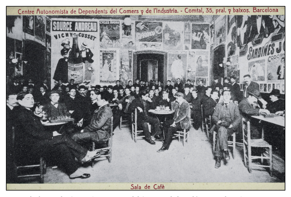
The bar at the Centre Autonomista del Comerç i de la Indústria, early 20<sup>th</sup> century

During the years prior to World War I a second type of Catalan-speaking immigrants arrived in Barcelona. These were fifteen- to twenty-year-old men, second or third sons of rural families. Following the Catalan heritage system, the first son was the heir ( l'hereu ) of the farmhouse ( el mas ) or family business. His brothers ( els fadristerns ) would only receive a part of the legacy, if any, at their parents' death. Therefore, especially in harsh times, they had to pack off and try to find a professional horizon in the towns or in the city. They had great expectations of finding a job upon their arrival in Barcelona. Some dreamt of being proprietaries, businessmen, shopkeepers or even writers, artists or intellectuals.<sup>4</sup> The most fortunate, with enough family funds, could enrol at professional schools or at the university, but they were just the lucky few.