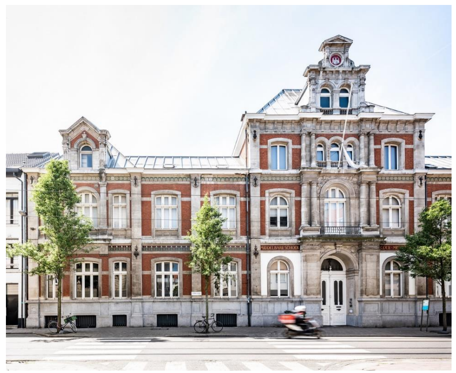
Figure 2: Frontage of the ADVN | Archive for National Movements

As a reflection of the state of research and novel insights in nationalism studies, this edition also tends to place various new accents on its content. One of the focal points is the international dimension of both the history of the Flemish Movement and research on it. After a general presentation of the DEVB-project by means of the two phases in the development of the encyclopaedia, we will briefly discuss this important but complex challenge.