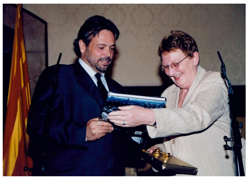
Figure 5: The Flemish politician Nelly Maes exchanges gifts with Ernest Benach i Pascual, former president of the Catalan Parliament (2003–2010), in the Catalan Parliament. The international dimension of the encyclopaedia is reflected in new introductory articles, among others on the Catalan and Basque nationalist movements. ADVN.

Finally, this objective of internationalising the study of the Flemish movement is further emphasised by the ambition to make at least part of the encyclopaedia (the introductory articles) available in English and French. The DEVB can thus present the study of nationalism in Flanders and the Flemish Movement internationally, and offer a platform and point of reference for an external target audience that wants to immerse itself in Flemish and Belgian issues.