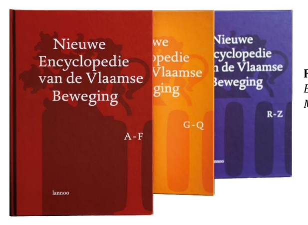
Figure 1: The New Encyclopaedia of the Flemish Movement , published in 1998