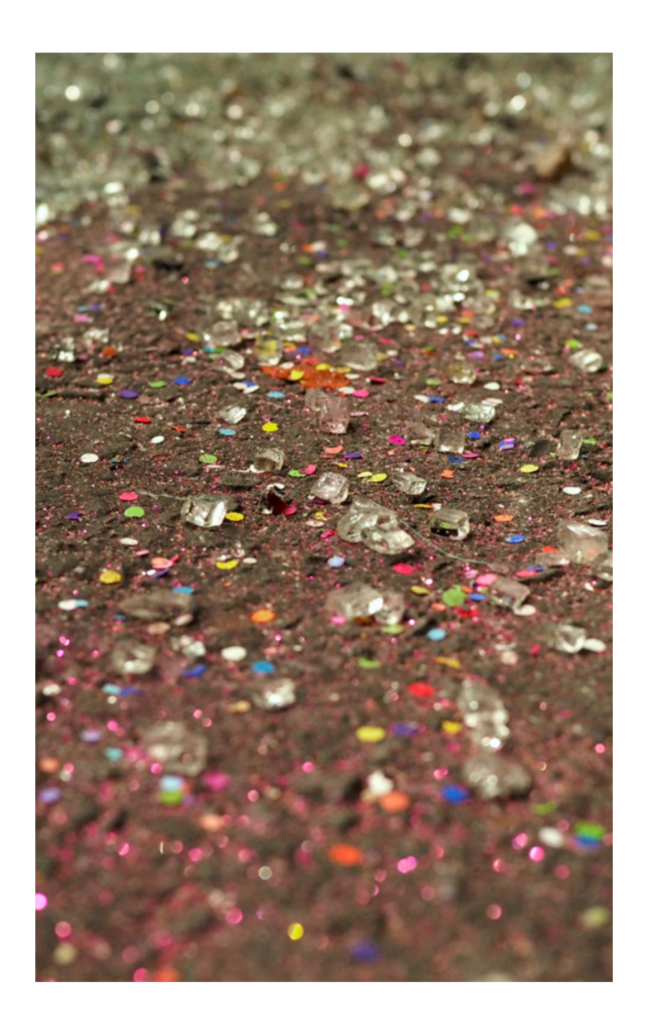
Studies in Social Justice, Volume 17, Issue 2, 259-268, 2023