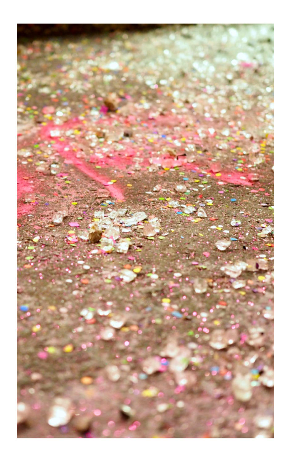
Studies in Social Justice, Volume 17, Issue 2, 259-268, 2023