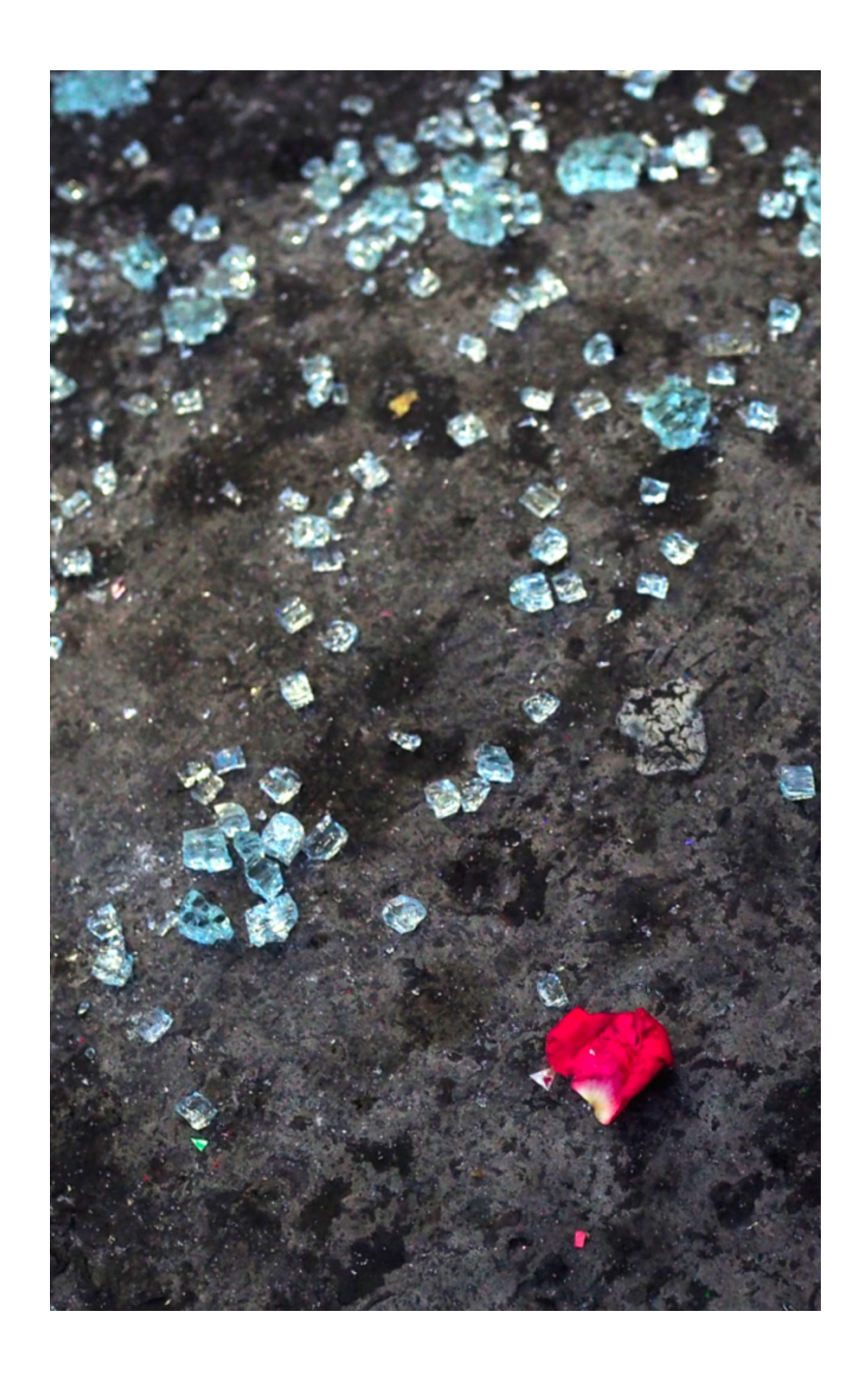
Studies in Social Justice, Volume 17, Issue 2, 259-268, 2023