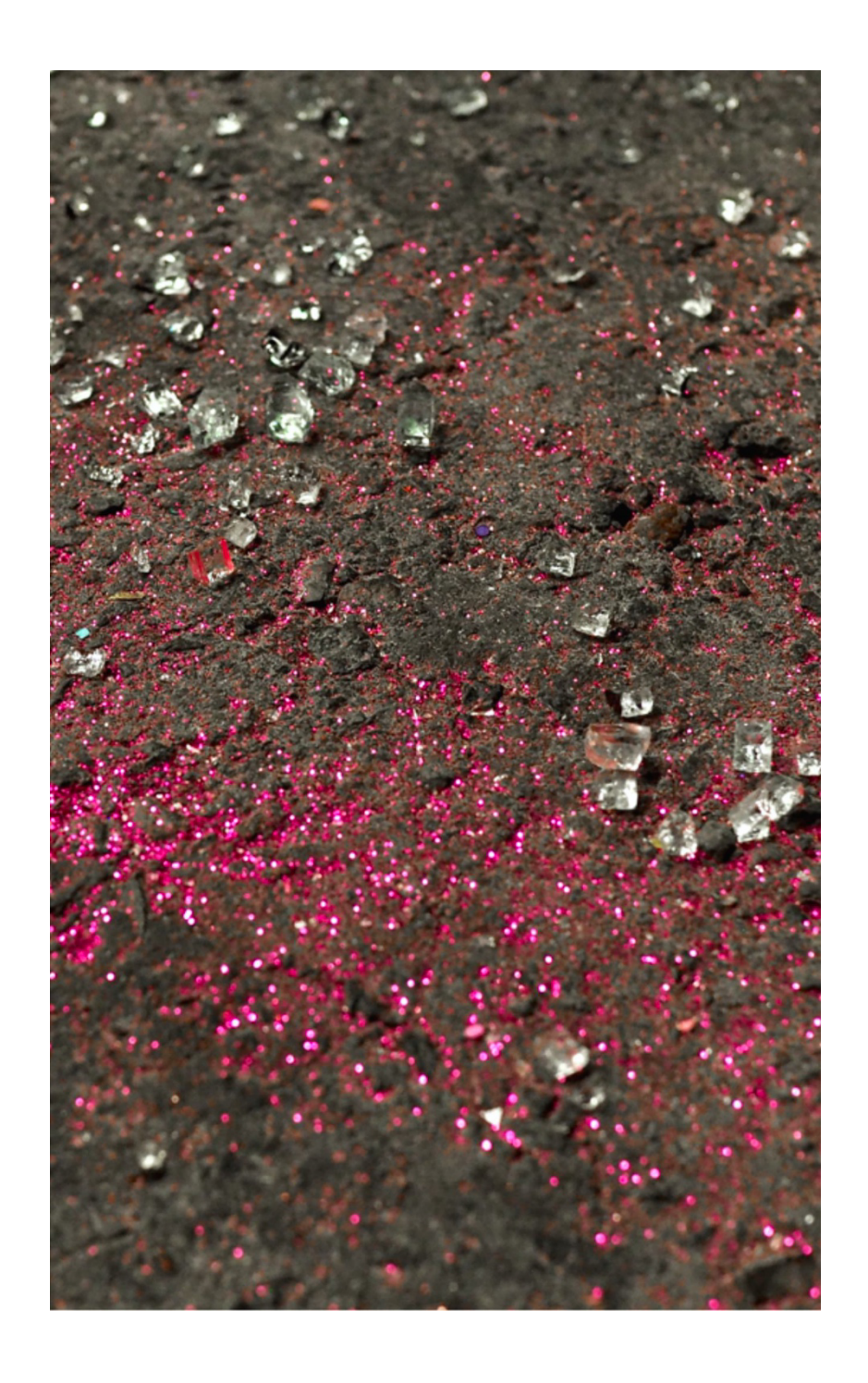
Studies in Social Justice, Volume 17, Issue 2, 259-268, 2023