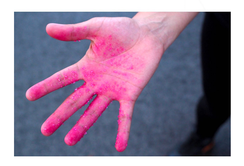
Studies in Social Justice, Volume 17, Issue 2, 259-268, 2023