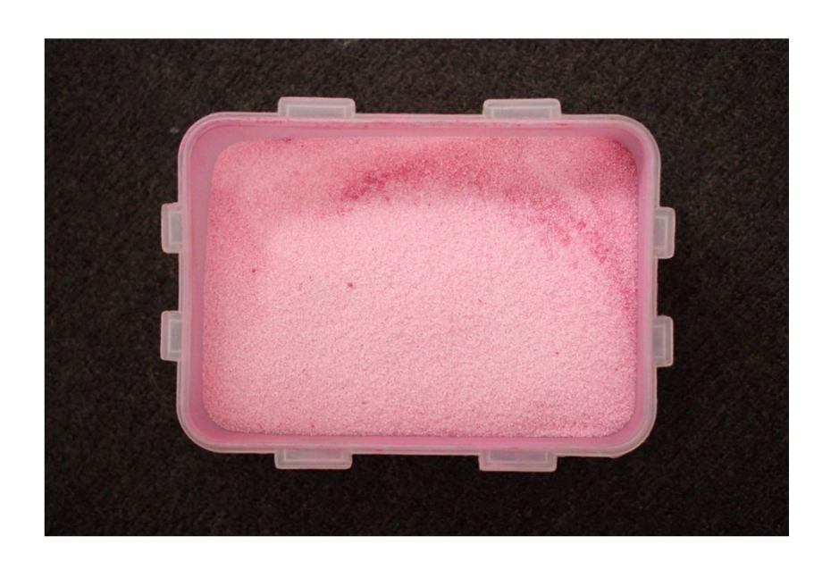
Studies in Social Justice, Volume 17, Issue 2, 259-268, 2023