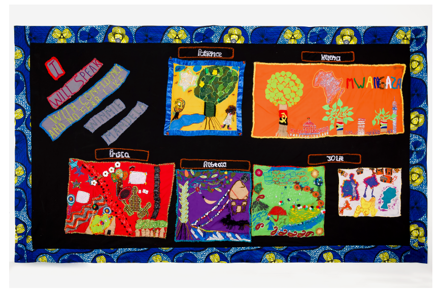
Figure 3. Collective Quilt 1: Mixed-media on fabric, 292 cm x 164 cm