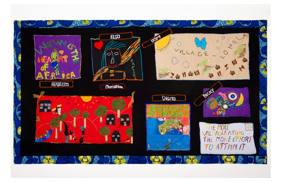
Figure 4. Collective Quilt 2: Mixed-media on fabric, 283 cm x 160 cm