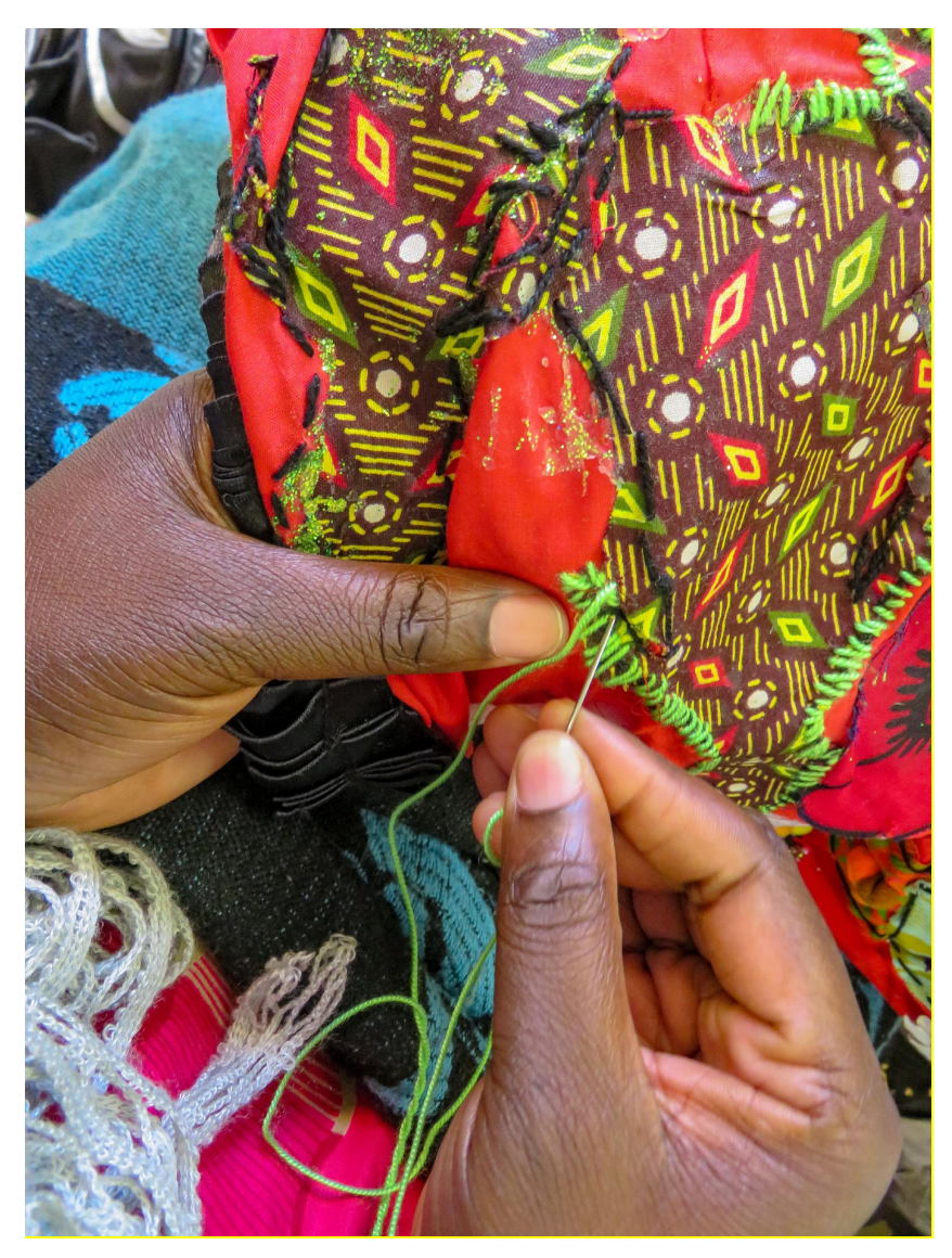
Figure 1 . Most of the women completed their individual quilt pieces during project workshops, but a few also took them home to work on in their own time

During project workshops, the women often spoke of their journeys to South Africa and the deep longing they feel for loved ones and places. They described their everyday experiences in Johannesburg and shed light on the