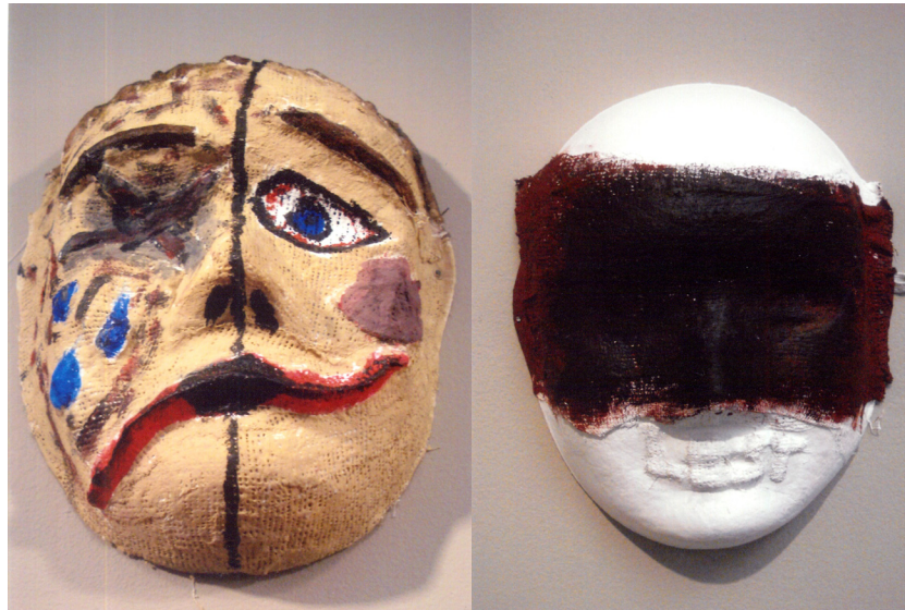
Studies in Social Justice, Volume 13, Issue 1, 159-170, 2019

Government of Ontario (2016). The Journey Together: Ontario’s Commitment to Reconciliation with Indigenous Peoples . Toronto, Ontario. Queen’s Printer. p.4