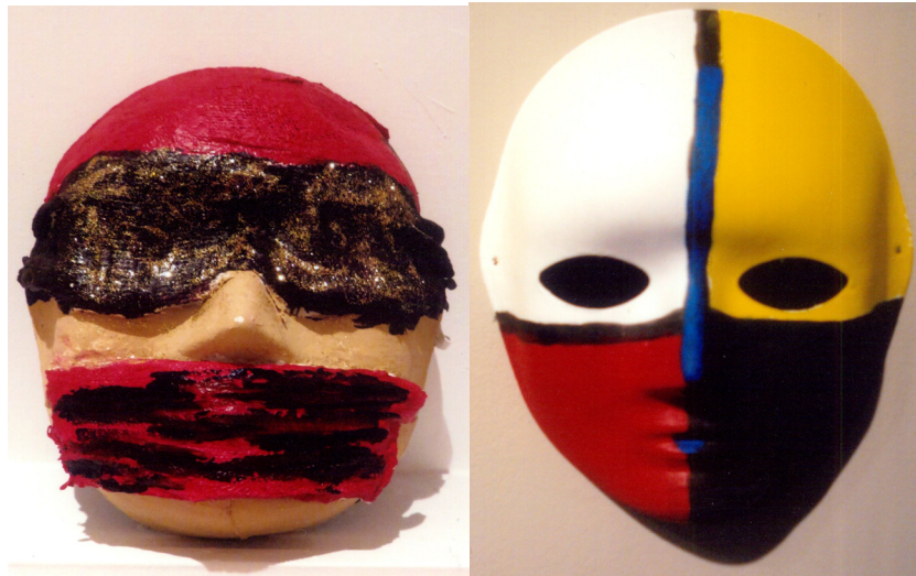
Mixed Media Masks

“Intergenerational trauma is real and alive in communities deeply affected by residential schools. You can’t attempt cultural genocide for 140 years, for seven generations – and not expect some very real fallout from that.” (Joseph Boyden, Ontario Métis author and advocate)