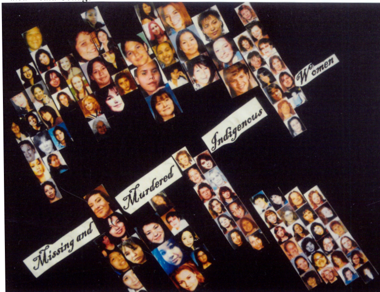
Mixed Media Collage

Studies in Social Justice, Volume 13, Issue 1, 159-170, 2019