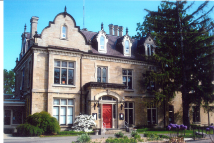
Rodman Hall Art Centre, Brock University (Exhibition Venue)