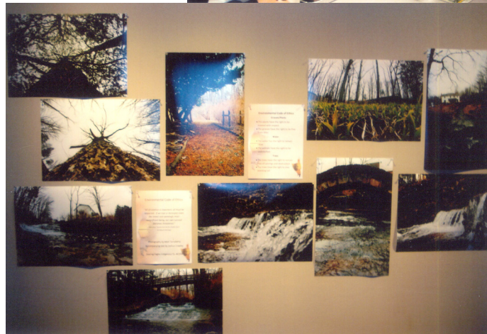
Photo Installation - Environmental Conservation