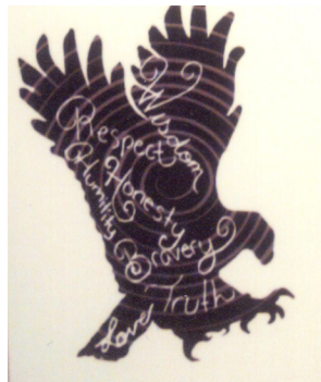
Soaring Eagles Logo