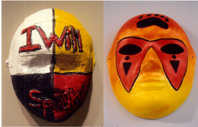
Mixed Media Masks

“The attempted cultural genocide that is the legacy of residential schools has produced debilitating intergenerational consequences. It is a dark chapter in our shared history. We cannot change any of that past, but by unearthing and truly understanding its impact, we give ourselves the power to change the future.”