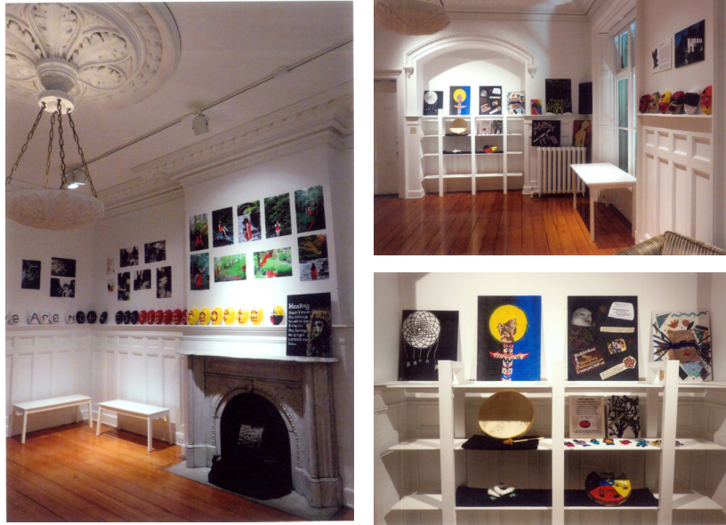
The exhibition is complete and ready for the Opening!

I continue my relationship with Soaring Eagles Secondary School and am planning the next art project to work with these eager and gifted students. Throughout the process, we were learning together. They were teaching me while I was there to teach them. Is this not what school should be all about? As Justice Murray Sinclair (2018), Chair of the Truth and Reconciliation Commission once shared, “Education is the key to reconciliation.”