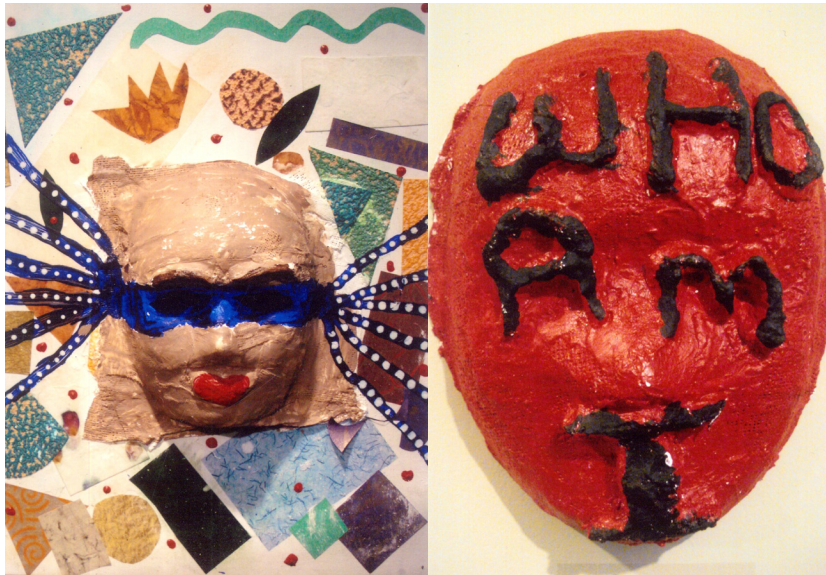
Studies in Social Justice, Volume 13, Issue 1, 159-170, 2019

Government of Ontario (2016). The Journey Together: Ontario's Commitment to Reconciliation with Indigenous Peoples . Toronto, Ontario. Queen's Printer. p. 46