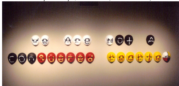
We Are Not A Conquered People, Mixed Media (Mask Installation)