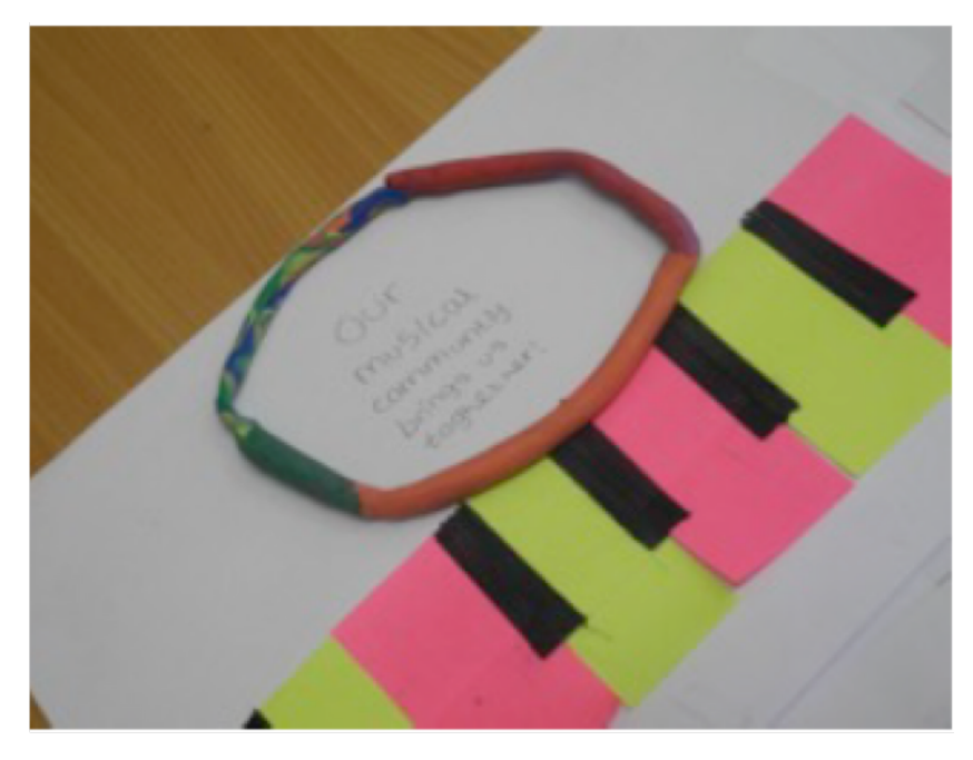
Figure 3. Our musical community brings us together.

practices of belonging. Many of the young people, for example, drew on a strongly musical culture from Eastern Europe. Musician John Ball encouraged them to hear the beat of the drum and in the potential space of listening to each other's beat the students were able to co-create a space of cohesion together. The research team of young people made a collage about their findings, shown in Figure 3. The collage shows the keys of the piano together with a plasticene circle, in which the expression, "our musical community brings us together," is written.