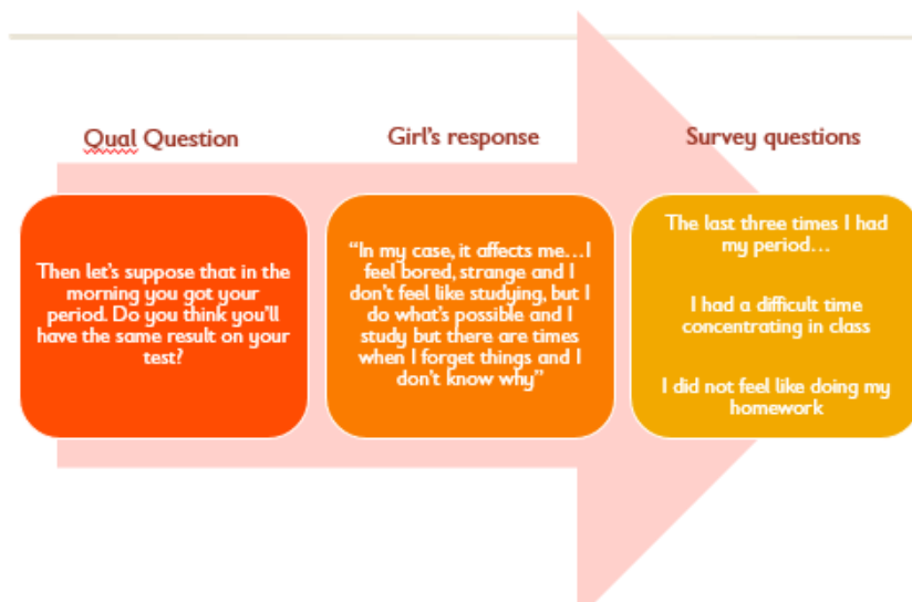
Figure 2. Development of a qualitative question in El Salvador to a MR-SSS survey question.

reliability, validity, and utility of the initial MR-SSS scale, including: measures of internal consistency; exploratory principal components analysis; exploratory factor analysis; and exploratory Mokken scaling procedures. Exploratory analyses were inconclusive; few questions meet final inclusion criteria for any procedure. Low interrater reliability measures, however, suggested potential challenges with the administration of the tool and format of the questions. Results were used to refine the MR-SSS survey questions and format as well as create an intensive enumerator training and survey protocol for subsequent surveys in the Philippines. A variation of the refined tool was also tested in Kyrgyzstan (April 2017) and Ethiopia (June 2017), though methods, translation, survey items, and oversight of data collection varied between contexts.