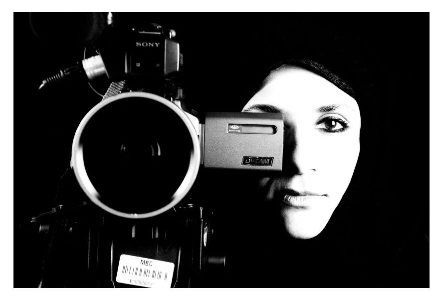
I Am a TV Producer (41 x 51 cm; silver gelatin fiber print, 2007)