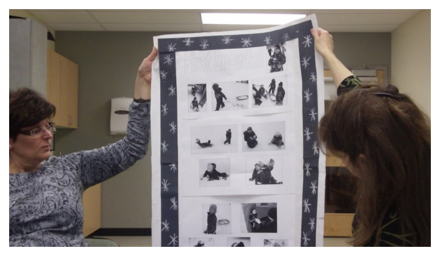
Figure 2. Educators discussing photo documentation.

Pidgeon, Munoz, Kirkness and Archibald (2013, p. 5) call for First Nations communities to re-establish ownership of their education to "...ensure the protection of the next seven generations' rights to good quality education that truly honours Indigenous ways of knowing, being, languages and values and culture." The Step by Step teachers developed their understandings as a result of careful listening and working alongside their students and colleagues.