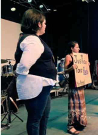
Figure 1. The Opening Ceremony

Paradigmatically, the images in Figure 1 illustrate transnational solidarities and connections in the Indigenous rights movements, which themselves form a specific assemblage that was highly visible on this opening day. They demonstrate the aspiration of globality within the WSF without neglecting plurality at local levels, while acknowledging and making explicit their mutual interconnectedness. This global-local nexus can be recognized as the conjunction of unity and plurality that characterizes the WSF. This perspective is also highlighted in Ong and Collier's (2005) use of assemblage thinking, where they break down the supposed opposition between the local