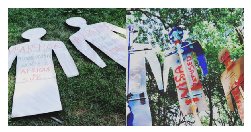
Figure 2. Silhouettes of absent persons

visa applications were rejected. This absence was materialized in the form of cardboard silhouettes during the opening march, as seen in the ethnographic vignette and in Figure 2.