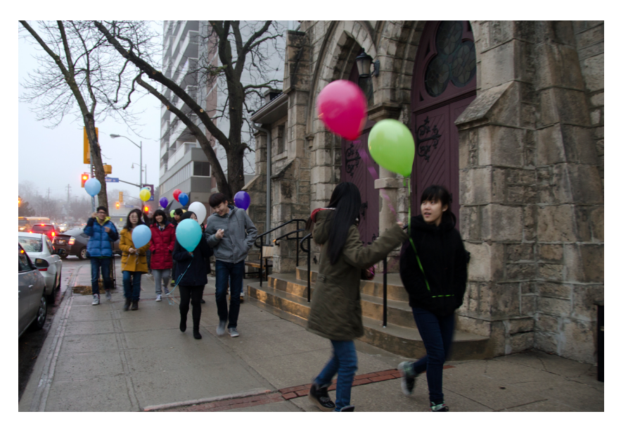
Figure 3: Stopgaps and Gems Parade; Youth with balloons parade to Guelph's St. George's Square to share their stories and creations.

the same way; gender, culture, race, personal histories, etc., shape different relationships to being in public space. This is something I experience myself as an artist who often works in public settings. I see a lot of public art that acts in a very claiming way, which is a much more comfortable position for those who move very freely in public spaces. Not to digress too much, since a proper conversation about power and access in public work would require an entire article itself, but I think it very important that the ways in which public intervention can be strange and uncomfortable for many participants not be skipped over. Even within this group of participants I think it was clear that there were differing levels of comfort; and though it would be impossible to accurately pull out specific factors affecting this, it is nonetheless important to note. This is why I think the very simple gesture of having balloons was actually quite important. It was a gentle way of claiming presence and making a collective performative space that eased the initial trepidation and allowed these brief, non-commercial transactions to play out. Not unlike what happened with the Sudbury project, it gave the youth permission to engage the downtown in a different way.