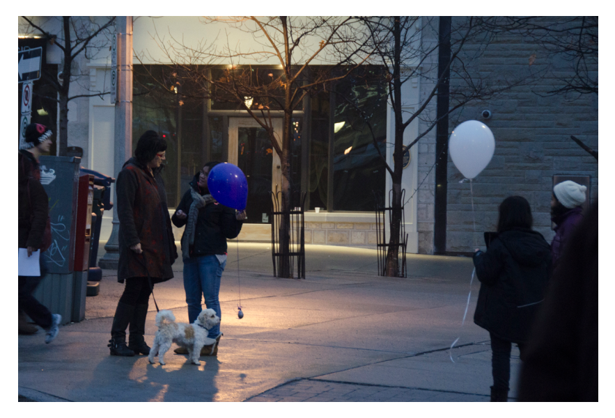
Figure 2: Rush hour sharing, Stopgaps and Gems; Youth speak with other members of the community.