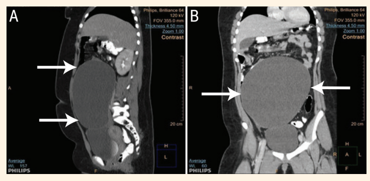
Figure 1: A contrast enhanced computerised tomography scan showing (A) a transverse view (measuring 20 cm) and (B) a craniocaudal view (measuring 23 cm) of the cystic lesion (arrows) in the abdomen of a 13-year-old female patient.