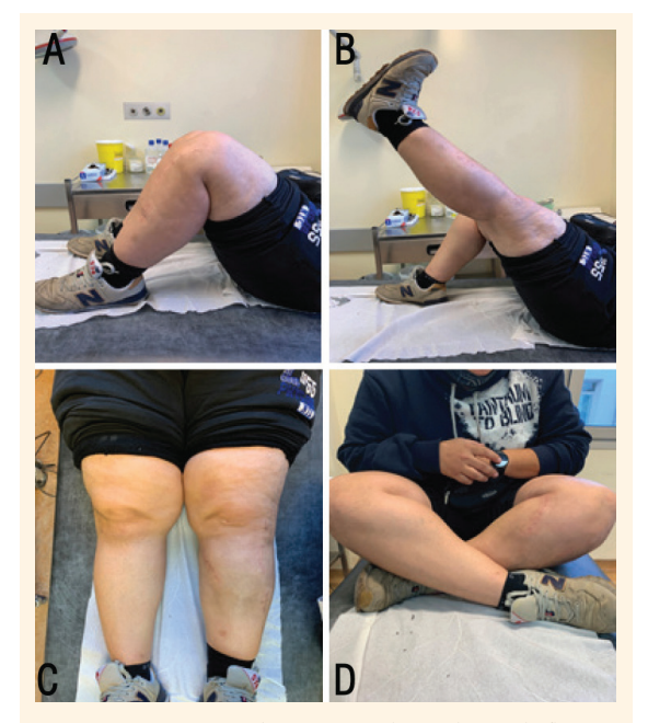
Figure 4: Functional pictures showed good flexion without extension lag (A, B), no varus/valgus malalignment (C) and patient's ability to cross their legs while sitting (D).

Radiological outcomes according to the column specific plating are shown in Figure 3. Statistical analysis showed that there was a significant difference between the Schatzker type V and type VI fractures in VAS and SF-36 (P < 0.05), while there was no significant difference on the WOMAC and modified Rasmussen criteria (P = 0.108 and P = 0.865, respectively) [Table 2]. Finally, all the patients were evaluated at the follow-up for the ROM, the extension lag, the flexion deficit and the malalignment [Figure 4].