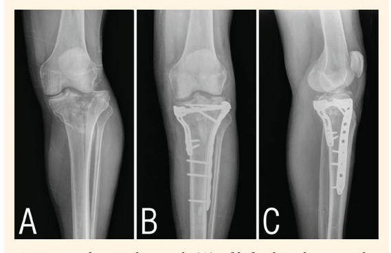
Figure 2: Plain radiograph (A) of left tibia showing the bicondylar tibial fracture and metaphyseal involvement (Schatzker Type VI). Plain radiographs ( B , C ) taken at the final follow-up showing the anatomic reduction.

their working status. Out of 57 patients, 19 reported a sport status before injury, while approximately 67% and 40% returned to sport activity after surgical treatment for Schatzker type V and type VI fractures, respectively [Table 1].