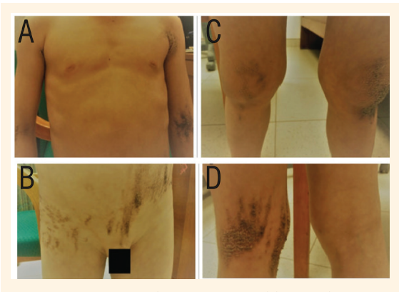
Figure 1: Verrucous hyperpigmented linear plaques in a 6-year-old boy involving (A) bilateral cubital fossae, axillae, (B) lower abdomen and (C & D) flexural and extensor surfaces of knee joints.