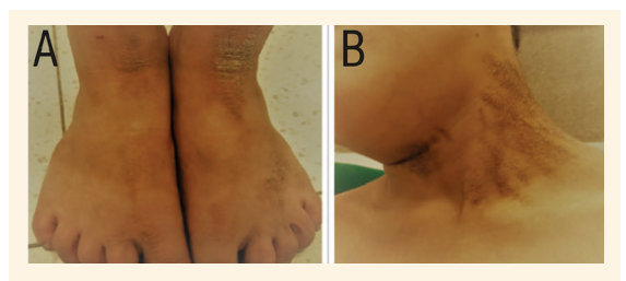
Figure 2: Hyperpigmented papules and plaques on the (A) dorsum of feet and (B) neck following Blaschko's lines.