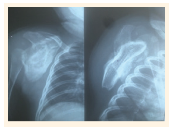
Figure 2: X-ray images of the right shoulder of a threemonth-old male infant showing diffuse scapular periosteal reaction with subperiosteal new bone formation.

had decreased upper extremity movements with pain during passive movement of the right upper extremity. However, deep tendon reflexes were well-preserved and there was no swelling or tenderness over other bones. The remainder of the systemic examination