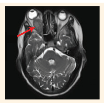
Figure 3: Magnetic resonance imaging scan of the head of a 50-year-old male patient showing a mass in the right orbit (arrow).

presence of the tumour. The pathological staging was pT4 and immunohistochemical stains were positive for synaptophysin and chromogranin, whereas Ki-67 was at 2% positivity in the tumour cells. The mesentery towards the tumour site was positive for the presence of the carcinoma. The omentum showed multifocal metastatic NET/carcinoid tumour presence with the largest nodule measuring 3.5 cm.