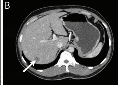
Figure 1: Computed tomography scan of a 50-year-old male patient showing (A) a mass in the mesentery of the small intestine (red arrow) and (B) a lesion in the liver (white arrow).

patient had normal bowel movements and no history of jaundice, fatigue or rectal bleeding. He had unilateral right-sided exophthalmos for two years. Although the patient sought medical advice for the exophthalmos, he did not receive a diagnosis or treatment. There was neither decline of vision nor history of headaches suggestive of raised intracranial pressure.