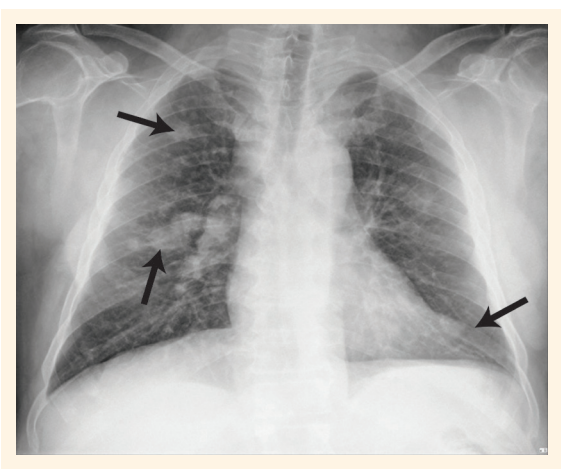
Figure 1: Chest X-ray of a 60-year-old man with shortness of breath upon exertion, orthopnoea and bilateral lower limb oedema showing several nodular opacities (arrows), predominantly in the right lung.