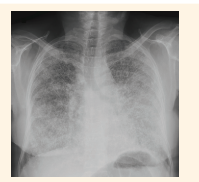
Figure 1: Chest X-ray of a 45-year-old female showing a bilateral dense micronodular pattern with fine reticulation.

mildly elevated pulmonary artery pressure and no evidence of valvular heart disease. A high-resolution computed tomography (CT) scan revealed extensive dense interlobular and intralobular septal thickening of the parenchymal window and dense microcalcification with a predominantly subpleural and peribronchial distribution, suggestive of pulmonary alveolar microlithiasis [Figure 2].