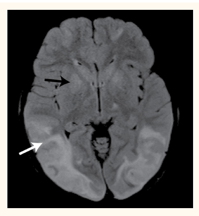
Figure 2: Magnetic resonance imaging of the brain of a five-year-old child on continuous peritoneal dialysis with acute bilateral vision loss. Hypotense T1 and hyperintense T2 signals were noted in the bilateral parietal, occipital cortical and subcortical areas, consistent with vasogenic oedema suggestive of posterior reversible encephalopathy syndrome (white arrow). Bifrontal and bilateral basal ganglionic hyperintensities were also present, likely due to calcification (black arrow). There was no evidence of cerebral venous thrombosis.

that the NAION was resolving with persistent bilateral disc pallor that was still more severe in the left eye compared to the right eye. Upon discharge, the patient's parents were advised of the importance of keeping their child hydrated and monitoring her BP in order to prevent further CPD complications. At a five-month follow-up, improvement was noted in the visual acuity of the right eye (0.6). However, vision in the left eye remained at counting fingers close to face.