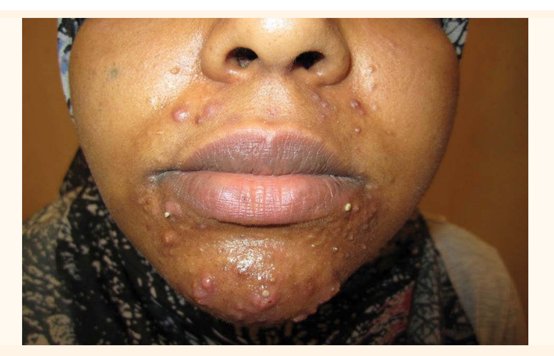
Figure 1: Photograph of a young female patient with moderate to severe acne vulgaris with pustular formation.

yield optimal long- and short-term clinical outcomes. Little, if any, high-quality evidence exists to support the effectiveness and safety of many existing therapies, particularly topical therapies. Evidently, new research is urgently required to better understand the biology and treatment of acne . Recent efforts have also identified potential genetic and molecular abnormalities; concepts of how best to integrate such advances into treatment algorithms will also therefore need to be addressed.<sup>7,8</sup> In addition, new research is needed to assess the comparative therapeutic effectiveness and safety of the many available medications for acne treatment, determine the best preventive strategies and investigate the natural history, subtypes and triggers of this condition.