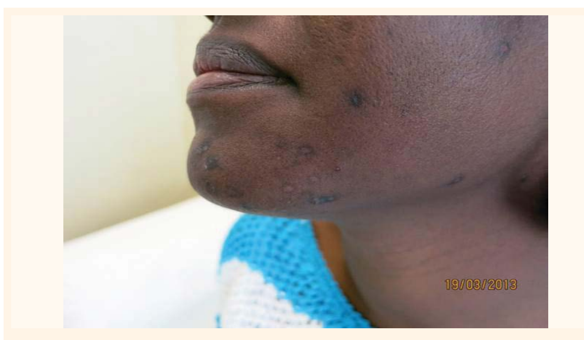
Figure 3: Photograph of a young female patient with post-acne vulgaris hyperpigmentation and scarring.

of multidisciplinary assessment for acne patients, preferably by a team which includes dermatologists, psychologists and psychiatrists.