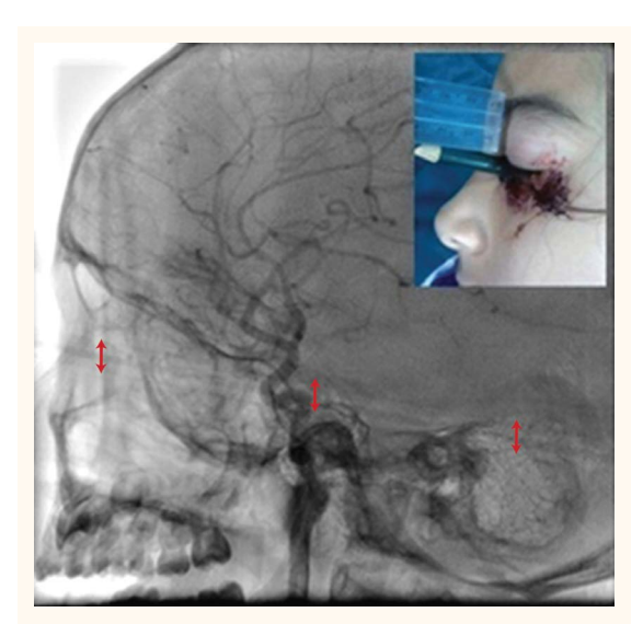
Figure 2: Normal four-vessel angiography scan in a seven-year-old girl with a very deep penetrating orbitocranial injury due to a pencil. The red arrows indicate the path of the foreign body. Inset: Photograph showing the foreign body entering the left orbit beneath the medial canthus .

Impalement through the eye orbit accompanied by transorbital penetration of the calvarium is rare. Most cases are reported in children.<sup>1,2</sup> Stab injuries of