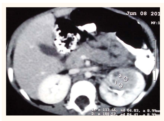
Figure 1: Contrast-enhanced abdominal computed tomography scan showing a well-defined hypodense mass lesion in the left kidney of a two-year-old girl with renal tuberculosis.

had been delivered at full term at home and was not immunised. She had no prior significant illnesses and her developmental history was normal. There were no signs of pallor, icterus, palpable lymphadenopathy or malnutrition. An abdominal examination revealed no palpable organomegaly or tenderness. The results of routine biochemical tests and a complete haemogram were within normal ranges and the child was negative for human immunodeficiency virus infection.