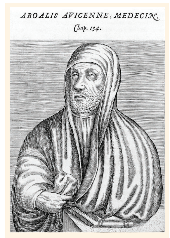
Figure 1: Portrait of Avicenna.<sup>17</sup>

following scripture.9 This free-thinking spirit coloured his medical practice and writings. Long before geographical boundaries separated modern day Iraq and Iran, Al-Razi was sought after as a physician both in his birthplace Rayy (near Tehran, Iran) and Baghdad (Iraq). A seminal feature of his genius was his acknowledgement of the wisdom of the Greeks and Romans balanced by relevant critique and correction when this wisdom was proved otherwise by his own observations and considerable experience, as expressed in his book Shukuk Ala alinusor (Persian = "Doubts about Galen").9