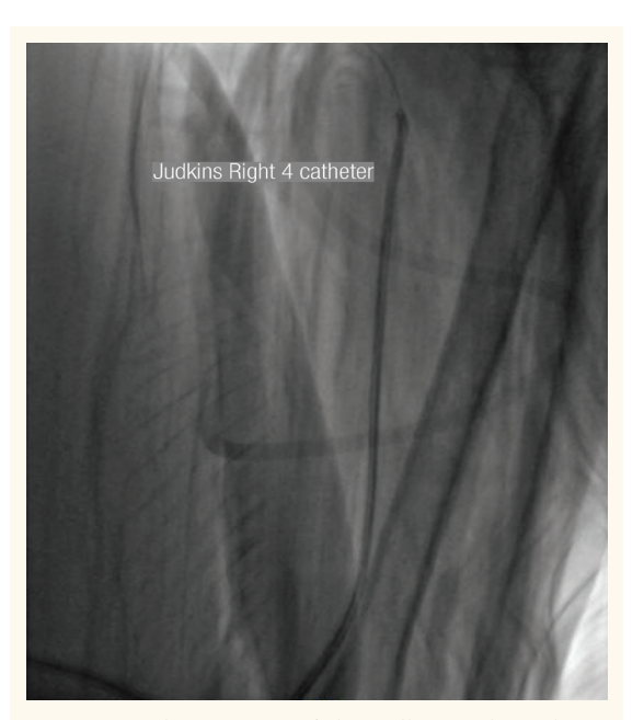
Figure 4: Advancement of the Judkins right catheter (JR4 5 Fr) through the left radial artery over the 0.014inch guidewire.