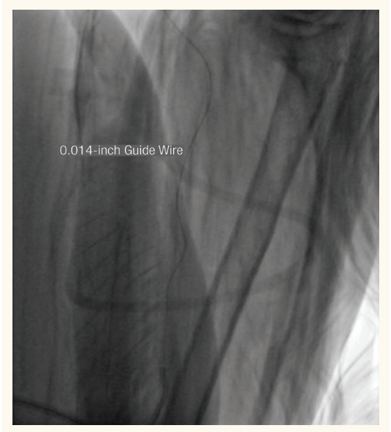
Figure 2: Fluoroscopy showing the straightening of the tortuosities of the left radial artery with the 0.014-inch guidewire.

If any resistance is encountered during the advancement of the wire, the operator should perform an angiogram to verify the underlying anatomy of the forearm arteries. This would enable the operator to negotiate the anatomic variations under fluoroscopy by using hydrophilic wire (Terumo, Tokyo, Japan) or even a 0.014-inch