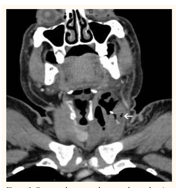
Figure 3: Computed tomography coronal scan showing a neck abscess with air pockets on the left side (white arrow). The foreign body is partly seen.

space of the neck [Figure 3] extending from the hyoid bone to the region of the pyriform sinus. It was seen involving the strap muscles and SCM. Posteriorly, it reached the carotid space and inferiorly it extended to the thyroid gland.