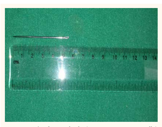
Figure 4: The foreign body (a 5.5 cm sewing needle) retrieved from the neck.

The patient was taken for emergency neck exploration under general anaesthesia. Incision and drainage of the abscess was done. Pus was evacuated and sent for culture and sensitivity. The foreign body was discovered in the neck abutting the left carotid artery. It was retrieved and found to be a 5.5 cm sewing needle [Figure 4]. The wound was washed thoroughly. A corrugated rubber drain was placed in the wound and secured and a nasogastric tube was passed and secured. The wound was dressed, and the patient was moved to recovery and kept overnight for close monitoring. Feeds were administered through the nasogastric tube. A blood culture was positive for methicillin-sensitive Staphylococcus aureus after 48 hours of incubation. The patient's vital signs returned to normal on the second post-operative day. The nasogastric tube and drain were removed on the third post-operative day, and the patient was discharged thereafter. An intraoperative endoscopy was not performed as the CT scan did not show a luminal foreign body.