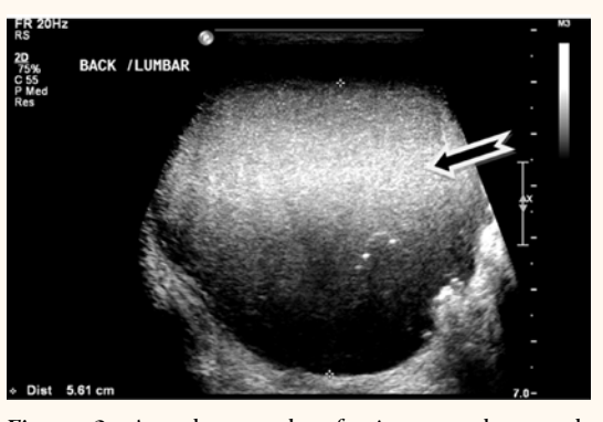
Figure 2: An ultrasound soft tissue study reveals complex fluid echoic lesion in the right paraspinal region, which is indicated by the arrow.

Investigations showed normal haemoglobin of 12.8 mg/L with normal complete blood