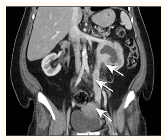
Figure 1: Contrast-enhanced coronal computed tomography scan of the abdomen. White arrows indicate an enhancing soft tissue mass extending along the left kidney, ureter and bladder.

A provisional diagnosis of transitional cell carcinoma was considered. A CT scan of the chest done for staging purposes showed a left breast lesion with significantly enlarged left axillary lymph nodes. Examination of the breasts at this stage revealed a 1.5 x 1.5 cm mobile lump in the outer upper quadrant of the left breast, and palpable, mobile, discrete, left axillary lymph nodes. A breast ultrasound and mammography were suggestive of malignancy. A bone scan did not show any deposits. The results of the CT-guided biopsies obtained from the renal and breast masses showed tumours with identical histological appearances. They were comprised of poorly cohesive sheets of round to polygonal cells with mildly pleomorphic nuclei. Some cells contained intracytoplasmic vacuoles. Signet ring-like cells and scattered mitotic figures were present [Figure 2]. The tumour cells stained positive for epithelial membrane antigen (EMA) and oestrogen receptor (ER). The staining was focally positive for cytokeratin (CK) 7 antibodies. Progesterone receptor (PR), human epidermal growth factor receptor 2 (HER2/neu), epithelial cadherin (E-cadherin) and CD10 and CK20 tests were negative. Ki-67 staining showed proliferative activity in 40-50% of cells. The pathological diagnosis was ILC of the breast with a renal metastatic deposit.