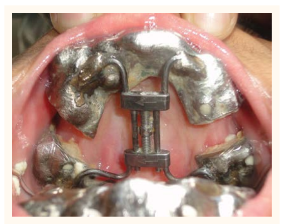
Figure 1: Distraction appliance in situ showing regenerate (patient 3).

with a mean age of 16.8 years (range: 13–26 years; 4 male, 1 female). All patients had permanent dentition. None of them had previously undergone alveolar bone grafting. Three of the 5 patients had an anterior palatal fistula, one had a tongue flap and one had undergone fistula repair. Written informed consent was taken from the patients and ethical permission was obtained. The patients were followed-up for a period of one year post-distraction.