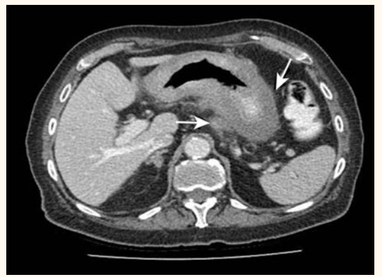
Figure 2: Computed tomography scan showing the grossly thickened wall (oblique arrow) and the perigastric extension of tumour (horizontal arrow).

so that the stomach acts as a funnel between the oesophagus and duodenum. As a result, food is easily regurgitated into the oesophagus. This was the commonest presentation in these series.