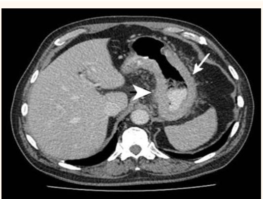
Figure 4: Computed tomography scan showing grossly thickened gastric wall (white arrow) and early perigastric involvement (arrowhead).

Linitis plastica generally arises from the lower third of the mucosa without destroying the architecture of the stomach wall. The mucosa is often spared malignant infiltration, making endoscopic diagnosis extremely difficult. Since macroscopic features do not permit the distinction between benign and malignant lesions, multiple endoscopic biopsies are required. The characteristic stroma reaction of the tissue is especially apparent in the submucosa, although it can also be noted in the muscle layer and subserosa.3 In most typical cases, the cells appear in a signet-ring form. The standard endoscopic biopsy specimens which contain only mucosa may result in a negative yield. One patient in these series had a negative first biopsy. In such patients with endoscopic suspicion, a diathermic snare can be used which will allow the acquisition