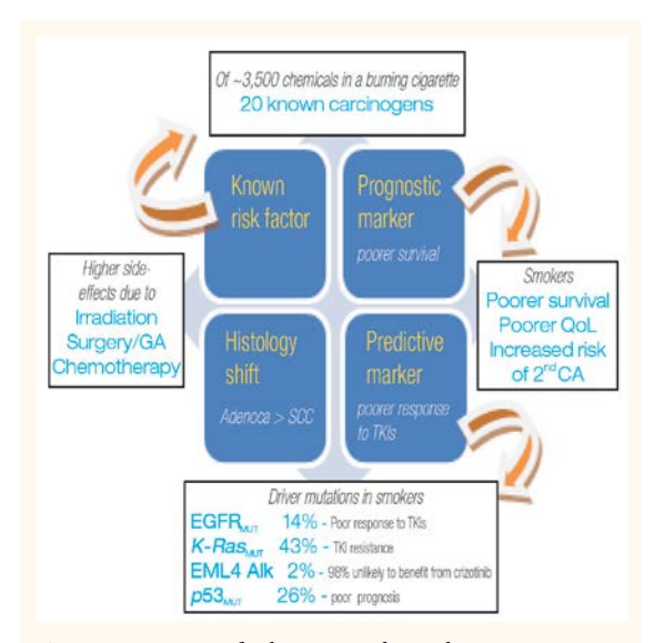
Figure 3: Impact of tobacco smoke on lung cancer. GA = general anaesthesia; Adenoca = adenocarcinoma; SCC = squamous-cell carcinoma; TK1 = tyrosine kinase inhibitor; QoL = quality of life; CA = cancer; EGFR<sub>MUT</sub> = epidermal growth factor mutation; K-Ras<sub>MUT</sub> = Kirsten rat sarcoma viral oncogene homolog mutation; EML4 Alk = echinoderm microtubule-associated protein like 4-anaplastic lymphoma kinase fusion.

such as with hereditary colon carcinoma. On the other hand, sporadic genetic defects which occur after exposure to environmental mutagens such as tobacco smoke, X- \gamma rays, chemical, hydrocarbons, viruses, etc., usually appear after a latent period of 5–20 years and therefore at older ages, such as in lung carcinoma.