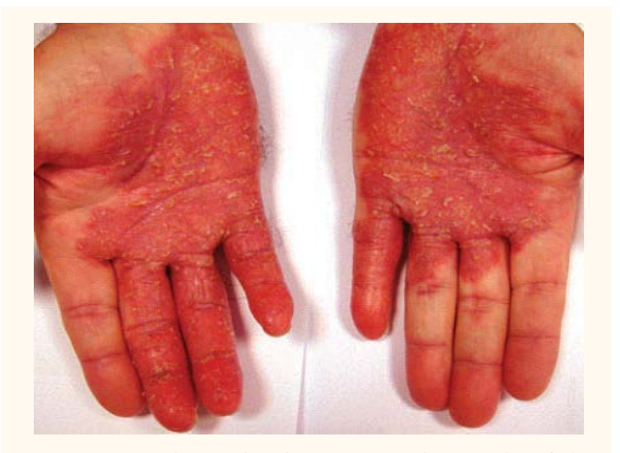
Figure 1: Tender scaly plaques on palmar side of the hands. The patient was unable to work.

Psoriasis on hands and feet is a disabling condition which highly impacts quality of life (QOL). It is a particularly challenging form of psoriasis due to its resistance to treatment; topical therapies usually fail because of the thickened horny layer of epidermis in these areas, and systemic conventional therapies do