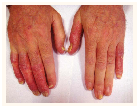
Figure 2: Nails were dramatically involved showing distal onycholysis, subungal hyperkeratosis, Beau's lines, and oil spot.