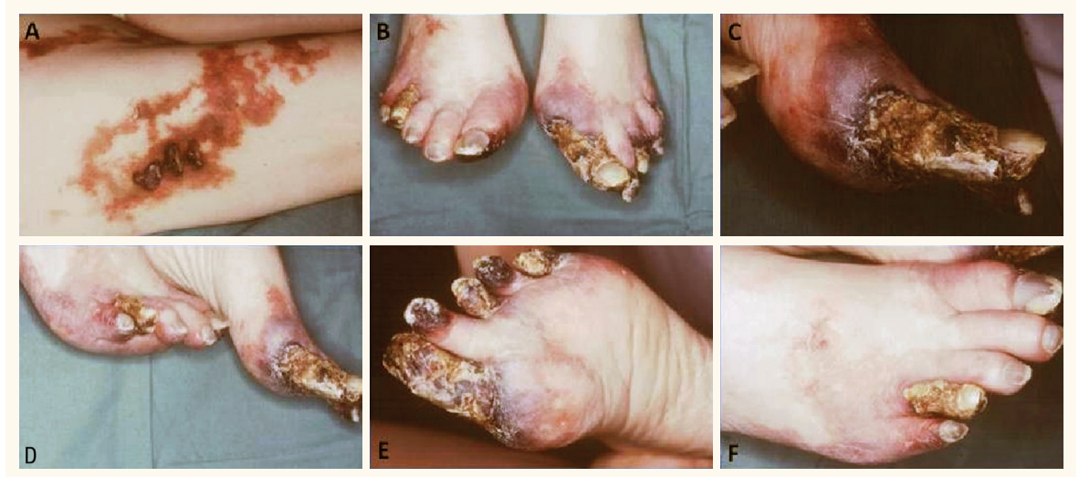
Figure 1: Case Two (A) Multiple necrotic thigh lesions at site of heparin injection; (B - F) Bilateral gangreneous toes.

both calves. The ventilation perfusion scan was indicative of pulmonary emboli. His blood count now showed Hb 11.2 g/dl, WBC 6.1 x 10^9 , platelets 49 x 10^9 /l. The platelets decreased further to 25 x 10^9 /l during the next few hours. The coagulation screen was normal apart from elevated D-dimers. HIT testing using aggregation studies was positive. He was commenced on hirudin and his platelet count returned to normal on the sixth day when hirudin was stopped. He was anticoagulated with warfarin for a further 6 months.