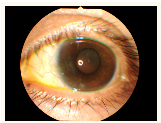
Figure 2: Left eye – 4 weeks after treatment showing no corneal stain/ healed ulcer.

the cornea. It is an active process associated with cell growth, remodelling of the connective tissue, angiogenesis and inflammation, triggered by ultraviolet irradiation. Different investigators have recently emphasised the importance of the limbus and its stem cells in the pathogenesis of the pterygium.<sup>1,2</sup> Surgery as a treatment for pterygium has been known since 1,000 B.C and has been directed towards excision, prevention of recurrence, and restoration of ocular surface integrity. The recurrence rate has, in the past, been estimated as high as 30-70%, despite adoption of different evolutionary techniques. 1,2,3 Although irradiation therapy and antimetabolite use have diminished the recurrence rate to 5-12%, complications like secondary glaucoma, cataracts, uveitis, corneal perforation, scleritis, scleral necrosis and secondary endophthalmitis can occur.<sup>1-5</sup> Mitomycin, isolated from Streptomyces caespitosus, is an extremely toxic, non cell-specific alkylating antibiotic with antineoplastic properties that selectively inhibits the synthesis of deoxyribonucleic acid (DNA),