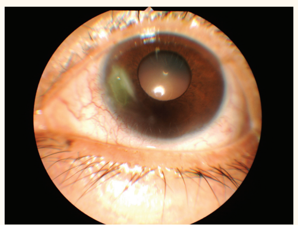
Figure\ 1b: Left\ eye-corneal\ scar\ temporal\ to\ ulcer.

28 YEAR-OLD WOMAN PRESENTED TO the Ophthalmology Clinic at the Armed Forces Hospital, Muscat, Oman, with severe pain, redness, photophobia and decrease in visual acuity of her left eye of 1 day's duration. She gave a history of a pterygium excision with intraoperative topical mitomycin-C application (0.1 mg/ml for 5 minutes ) in the same eye two years before. There was no other systemic or local disease. She underwent a detailed ophthalmic and systemic evaluation and laboratory examination. The best corrected visual acuity in her right eye was -0.25sph/-0.50cyl /90 = 6/6 and in the left eye -0.25sph/-1cyl 140 = 6/12. Her left eye showed conjunctival and ciliary congestion. There was a linear ulcer on the cornea about 2 mm from the