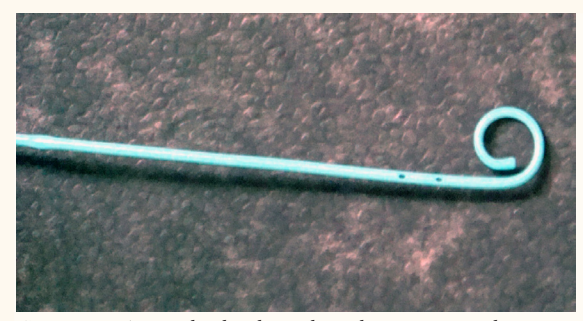
Figure 3a : A standard J-shaped tip diagnostic guide wire that is commonly used during left heart catheterisation procedures.