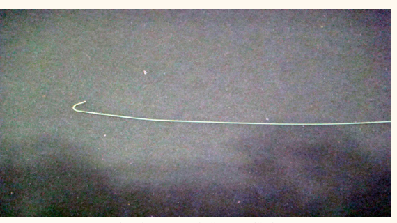
Figure 3b : a standard 6 French "pigtail" diagnostic catheter.

complications are more common with right heart catheterisation, patients with left main stem (LMS) coronary artery disease (CAD), patients with low ejection fraction (EF) < 30%, and patients with high New York Heart Association (NYHA) class IV. This report describes the case and reviews the literature on the incidence, significance and the implication of this complication during cardiac catheterisation procedures.