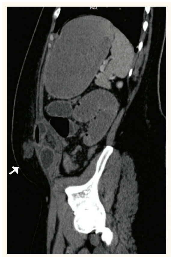
Figure 3: Computed tomography (CT) scan, sagittal view, shows the dilated small bowel which is protruding into the muscular layer of the abdominal wall (arrow).

excessive vomiting and severe epigastiric pain, her last bowel movement had been 2 days previously and she had not passed any flatus per rectum for one day. The abdominal X-ray was repeated and showed evidence of small bowel obstruction (dilated small bowel, with multiple air fluid levels). This was followed with an abdominal computed tomography (CT) scan which showed evidence of a left-sided abdominal wall incisional hernia with entrapped bowel loops between the abdominal muscles [Figures 1, 2, and 3]