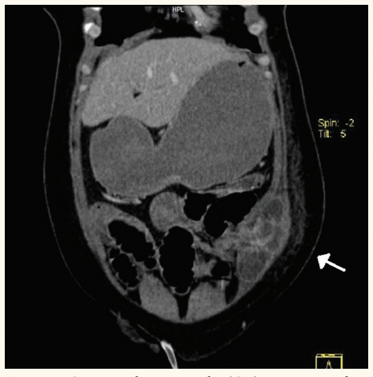
Figure 2: Computed tomography (CT) scan, coronal view, shows the entrapped small bowel loops in the muscular layer of the abdominal wall (arrow).

A 42 year-old lady, who had had a previous laparoscopic cholecystectomy in Chennai, travelled abroad for treatment of her chronic abdominal pain, secondary infertility and second degree vaginal prolapse. She was 158 cm in height and weighed 85 kg. She underwent a hysteroscopy with Fothergill's operation and laparoscopic myomectomy. Under general anaesthesia the patient was put in the lithotomy position. The hysteroscopy showed a subseptate uterus so septal resection was done. The anterior vaginal wall and posterior vaginal wall reflected off the cervix. The cervix was amputated 5 cm away from the internal os and homeostasis was secured. A Fothergill's suture was applied to cervix and a neocervix created. Complete homeostasis was then secured and there was no undue bleeding. A 12 mm trocar for the laparoscope was placed in the supraumbilicus area. The pneumoperitoneum was then established with carbon dioxide and the intraperitoneal pressure was maintained at 10 mm