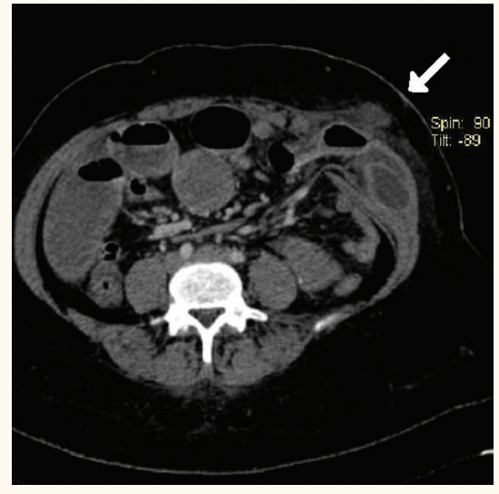
Figure 1: Computed tomography (CT) scan shows the dilated small bowel which is protruding into the muscular layer of the abdominal wall (arrow).

The following report describes a case of a trocar site hernia that evolved to a strangulated small bowel after laparoscopic myomectomy. We describe the significance of complete closure of the fascial defect at the trocar site in the prevention of this condition and the risk factors involved, as well as the importance of early diagnosis to avoid serious subsequent events.