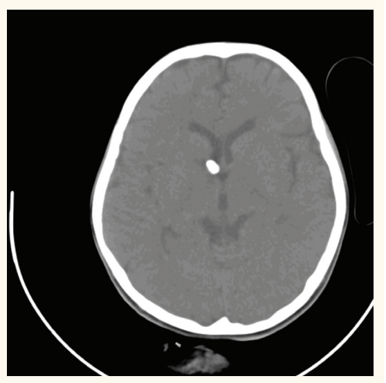
Figure 2: Non-contrast computed tomography scan showing multiple subependymal calcified foci noted in both lateral ventricles.

not only for the person him/herself, but also for the family and the community. These include: school failure, smoking, drug abuse, alcoholism, road traffic accidents, domestic injuries, family problems, juvenile delinquency, occupational difficulties, etc.3,11,12 The treatment of ADHD is multimodal, including special education, psychotherapy and psycho-pharmacotherapy. The prognosis of ADHD depends on many factors including the severity of the condition, early diagnosis and treatment, comorbid conditions (especially mental retardation), and the availability of a supportive environment at school and at home.