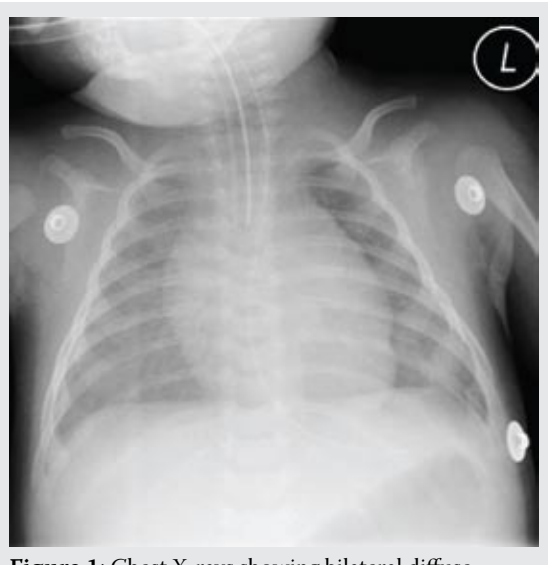
Figure 1: Chest X-rays showing bilateral diffuse opacification of both lung fields, ground glass appearance suggestive of pulmonary hemorrhage

1]. A computed tomography (CT) scan of the chest showed bilateral alveolar opacities [Figure 2]. The CT scans of the brain and abdomen were normal. The electroencephalogram (EEG) did not show any epileptic activities. Both the electrocardiogram (ECG) and echocardiography were normal. Blood, sputum, urine and stool cultures were negative for bacteria and fungus. The auto-antibodies screen was negative including for anti-nuclear antibodies, rheumatoid factor, anti-mitochondrial antibodies, anti-smooth muscle antibodies, antireticulin antibodies, anti-neutrophil nuclear anti-bodies (C-ANCA), myloperioxidase (MPO-ANCA) and proteinase-3 (PR3-ANCA). A specific immunoglobulin E (IgE) to cow's milk was negative, an IgG to cow's milk was not feasible. Haemosiderin laden macrophages were negative on the gastric aspirate that was done on day 9 of the illness. An interview with both parents showed that there were no smokers at home or a source of moulds since they live in a new house with no water leakage or heating system.